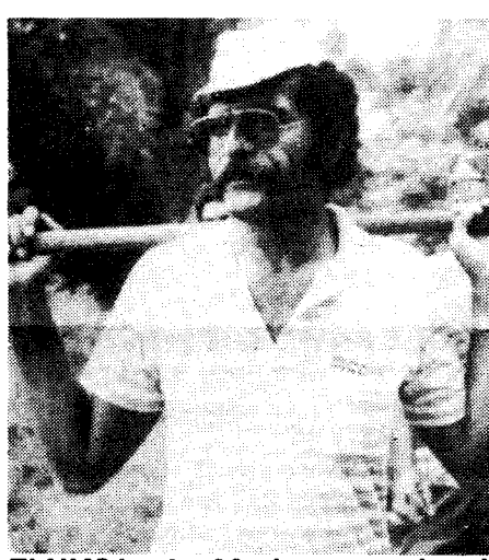
FLNKS leader Machoro: murdered by Mitterrand's praetorian guard.

French imperialism, responsible for the decimation of the Kanaks, cannot offer the slightest solution. It's the task of the French proletariat — and above all of the Australian — to take