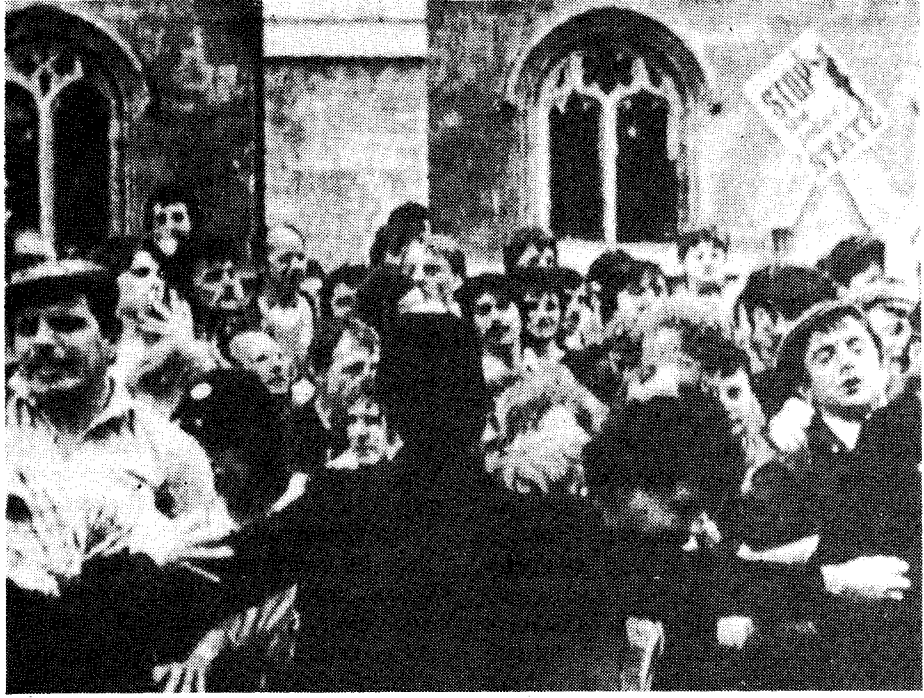
Heroic miners battle cops outside House of Commons. Defeated and bloodled, the miners' union is not broken.

The British miners strike has been defeated, but the union has not been broken. For one full year, twelve long and bitter months, the coal miners fought valiantly against the British bosses and the bloodthirsty Thatcher regime. It was the sharpest and most deep-going conflict of British labour since the turn of the century. The Thatcher regime and the rotten edifice of British capitalism was profoundly shaken by the Miners Union who fought for all labour and the oppressed. Isolated and betrayed by the scabherding tops of the trade unions and the Labour Party, the miners and their wives resisted heroically. Their pickets were arrested and even murdered, martial law was instituted in the coal fields, mining villages were devastated by Thatcher's occu-pation army of cops and thugs. Hardship conditions rivalling those of the period of the General Strike of 1926 were imposed on the miners' families. On March 3rd a delegates conference of the National Union of Mineworkers (NUM) voted narrowly to call off the strike. Hundreds of miners fervently lobbied to continue the strike. Even after the vote, Kent and Scottish areas of the NUM voted to hold out while negotiating for amnesty. There is widespread comradely