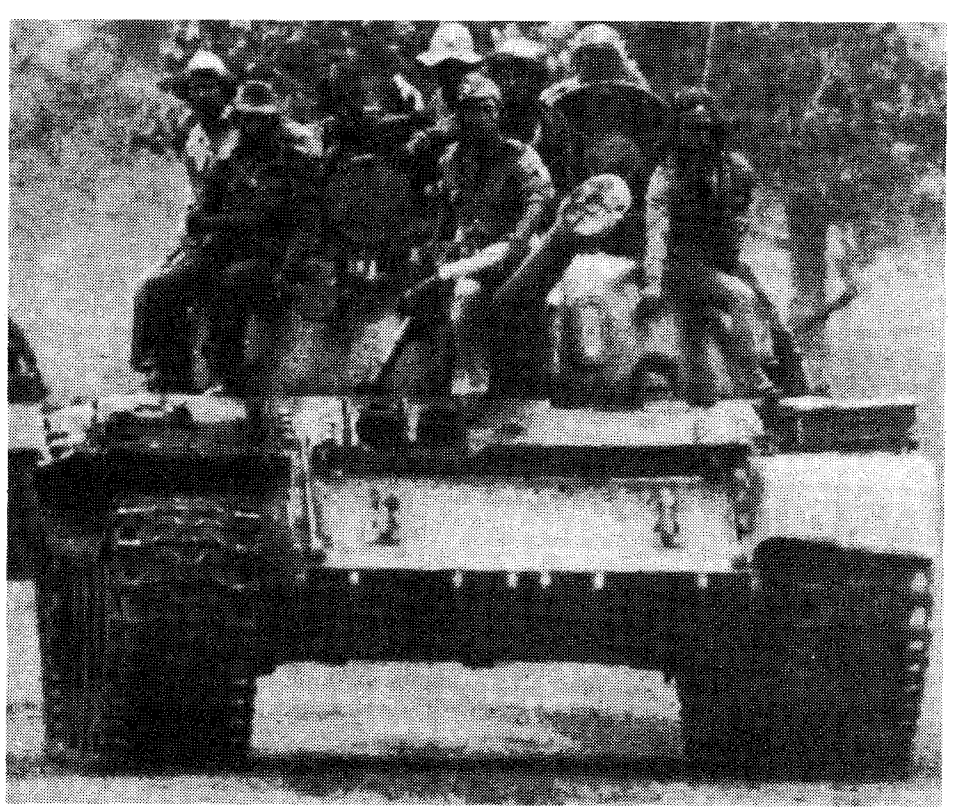
Vietnamese-backed Kampuchean troops atop Soviet-built T-54 tanks roll over counterrevolutionaries.

and the Chinese, who escalated their border attacks on Vietnam in response.