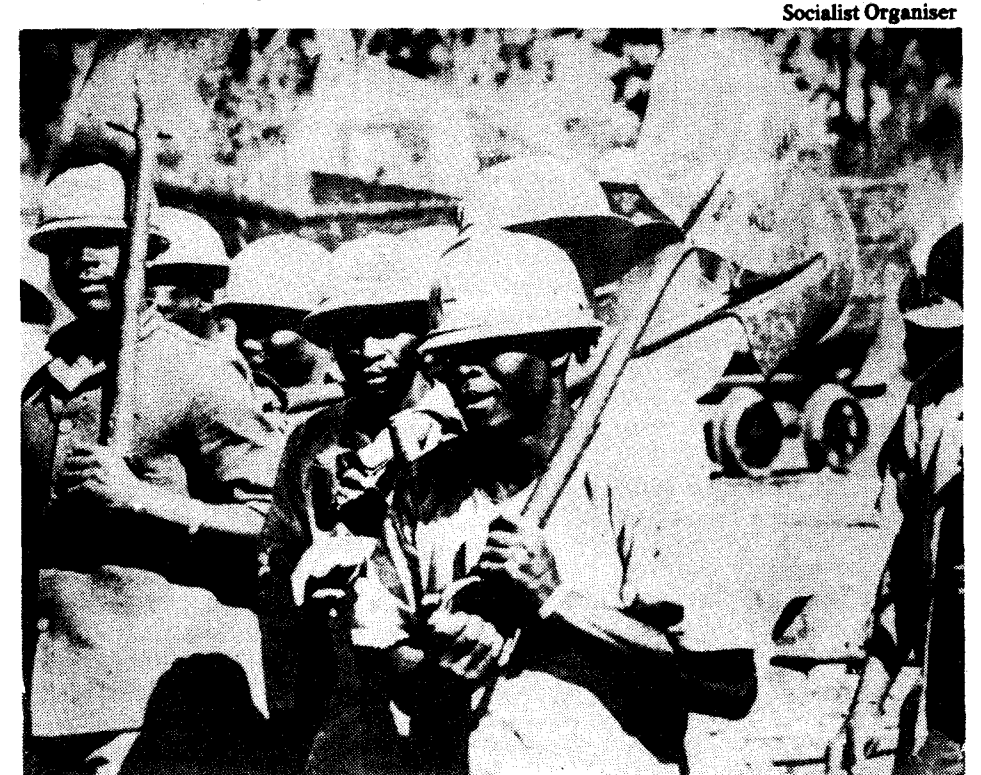
Black miners: International monetary system rests on their sweat and blood.

However, these days South African "power-sharing" futures are selling