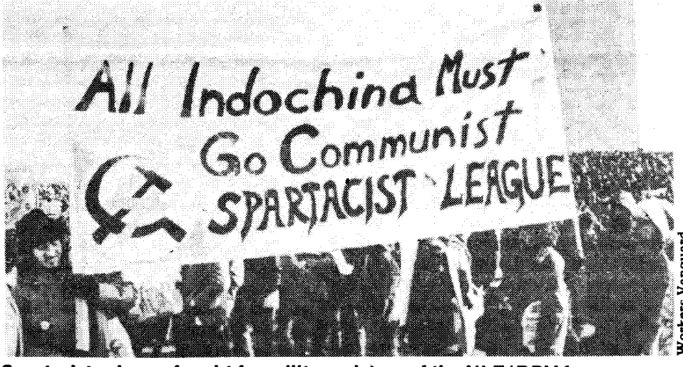
Spartacists always fought for military victory of the NLF/DRV forces against imperialism.

We Spartacists, who seek to continue the struggle of Lenin and Trotsky, published a pamphlet in 1976 defending the Vietnamese Trotskyists