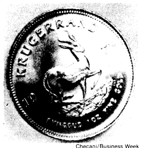
South African rand plunges as capital flees.

Thus the threat of black revolt triggers international financial panic.