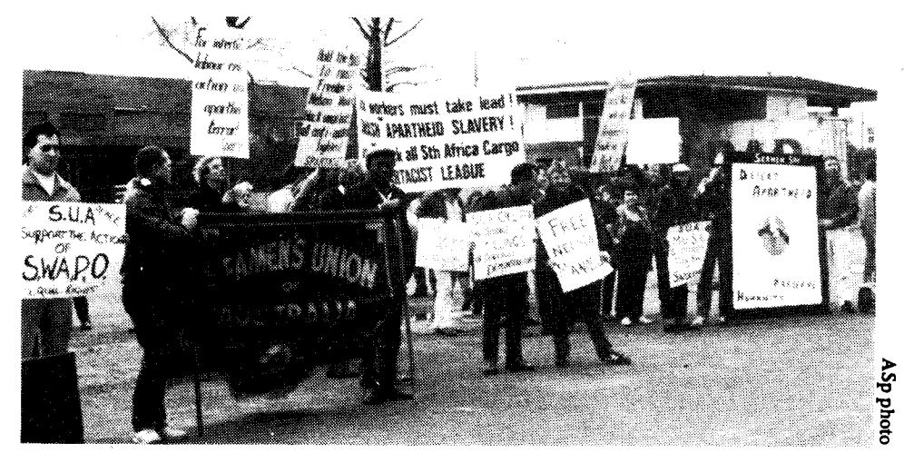
70-strong waterfront picket against Safocean Mildura, Melbourne 5 August.

Particularly after the Vietnam war, opposition to apartheid was essential