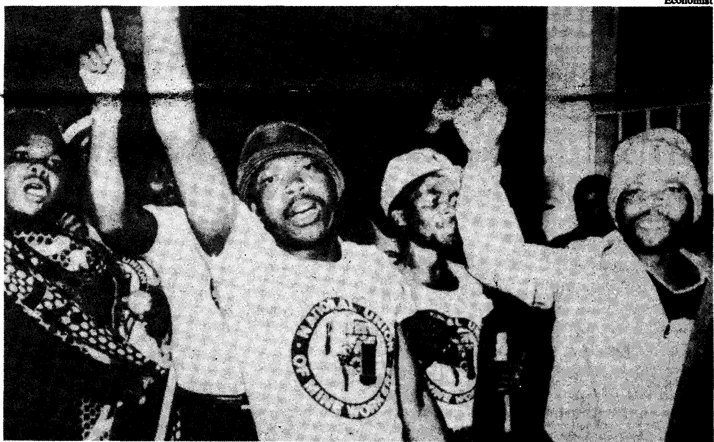
Apartheid Fuhrer P W Botha (Top). Gold miners: workers need Leninist party to lead black freedom struggle.

The massive anti-apartheid upheaval poses pointblank the question of power: Who shall rule? "Tutu's brand of moderate leadership is rapidly losing ground among the street fighters", wrote Newsweek's Robert B Cullen and Ray Wilkinson. revolution awaits its Lenin." For stating this simple truth, the apartheid regime threw Wilkinson out of the country. But precisely what is lacking, and is more urgently required in South Africa than anywhere else in the world right now, is a party of the kind that Lenin built in tsarist Russia: an internationalist and multiracial revolutionary workers party that can mobilise the giant of South Africa's black proletariat for its own class dictatorship as the emancipator of all the oppressed. The black proletariat last November in the Transvaal showed its power in the most massive general strike in the history of South Africa. But since then