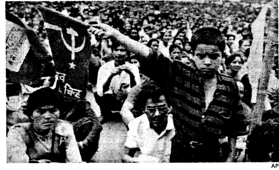
Communist Party election rally in Nepal. Stalinist mass parties in Indian subcontinent tie workers to reactionary bourgeois order.

But both the CPI and CPI(M) are wedded to the politics of coalitionism, tying the proletariat to the wheels of one or another bourgeois party in the name of democracy, and both uphold capitalist India's "unity" against "secessionists." The CPI(M)-led government of West Bengal is aggressively encouraging capitalist businessmen, including the chief minister's son. India more than perhaps any other country on the face of the earth is proof positive of Trotsky's theory of permanent revolution, an object lesson in the futility of seeking to fulfill the tasks of the democratic revolution in a backward country under capitalism. There has been capitalist development: the "Green Revolution" of applying science to agriculture virtually eliminated India's import of grains; the country has built up large-scale heavy industry. Yet this is combined with truly horrendous social conditions, the bride burning, caste oppression, national subjugation, hunger and grinding poverty on a mind-boggling scale—the list is