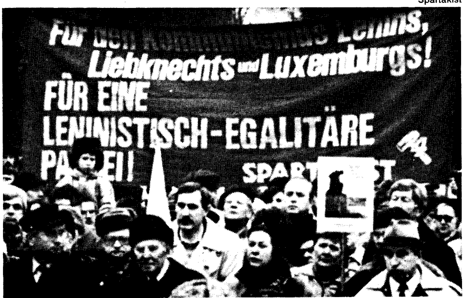
East Berlin, December 1989—Spartakist banner at anti-fascist demonstration. Uniquely, we fought against capitalist reunification.

degenerated or deformed workers state, all the various Stalinists can offer is support to a faction of the disintegrating Soviet bureaucracy, or to long for the "good old days." At the Sydney forum a Turkish follower of Albania's late Enver Hoxha spoke in praise of Stalin. But the Gorbachevite bureaucracy are the legitimate political heirs of Stalin! The ACUer exclaimed at one point: "If we don't support the remnants of the Gorbachev supporters, who are we going to support ... the Chinese?" China's version of "market socialism" provoked an incipient workers political revolution in 1989, brutally crushed by the Beijing bureaucracy at Tiananmen Square! Then there's the Socialist Party of Australia (SPA), which supports the "patriots" in the CPSU. This faction, exemplified by the Soyuz group of the Supreme Soviet, do not oppose "market reforms." They want a return to Stalinist "order," and appeal to reactionary Russian nationalism and even outright anti-Semitism.