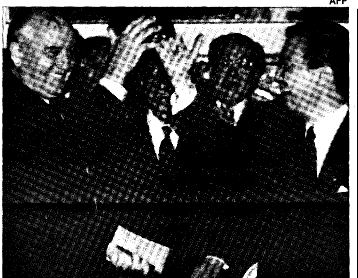
Japanese prime minister Kaifu (right) tells Gorbachev: give us Kuril Islands (boxed area in map shows islands demanded by Japan). Imperialists want to bottle up Soviet fleet in Vladivostok and Sea of Okhotsk.

USSR Sakhalin Manchuria Vladivostok CHINA Sea of Okhotsk Sakhalin N. KOREA Japan S. KOREA Tokyo Pacific Ocean Tsushima Straits