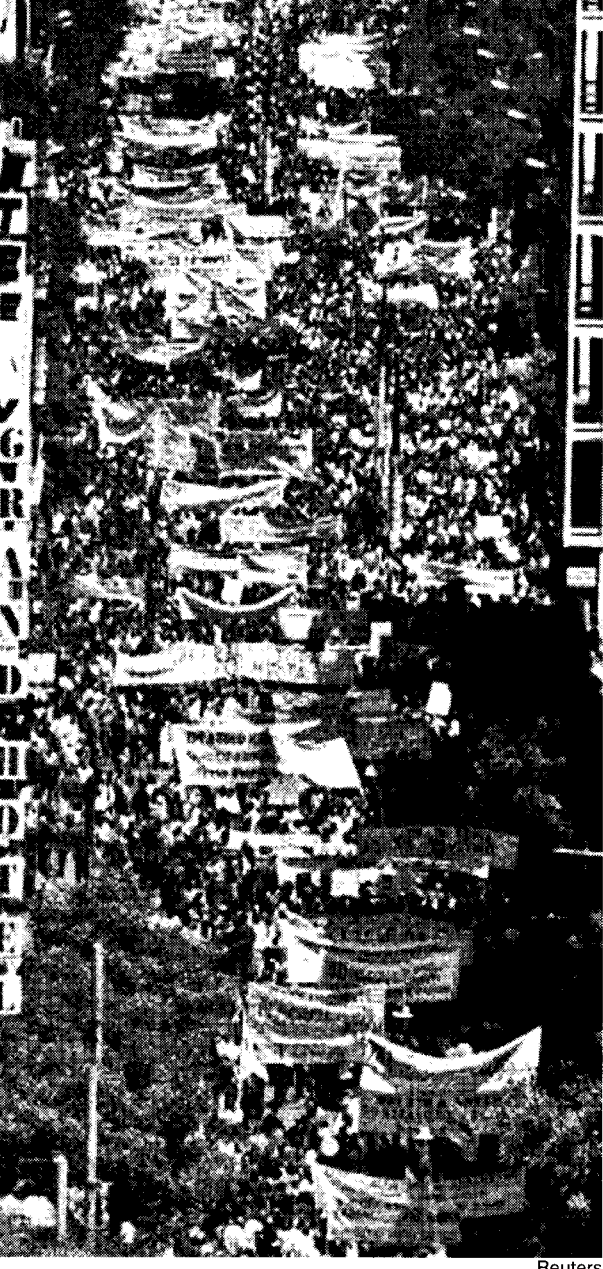
Mass demonstration in Athens during April 2001 general strike against attacks on pensions.

The main institution for the oppression of women is the family. For the ruling class the family serves as the vehicle for continued on page 10