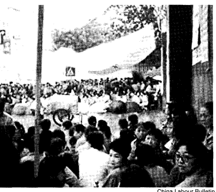
of the 1949 Revolution. ■

In the face of the fundamental hostility of the capitalist states to the very existence of the workers states, it is indispensable to distinguish between working-class opposition to bureaucratic abuse and imperialist opposition to the workers states themselves. No genuine proletarian opposition to the Stalinist misrulers can be built without a firm commitment to defending the gains of the Chinese Revolution. A Trotskyist party in China would inscribe on its banner: Defend the system of collectivized property, the central gain