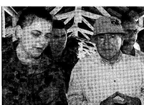
February: Prime minister Howard with Australian soldiers in Aceh. Australian imperialists have been expanding military presence in Asia-Pacific region. Right: Troops take over Solomon Islands, July 2003.

immediate and generous outpouring of monetary and other aid by trade unionists and individuals across Australia. Geelong oil refinery workers voted to increase their union's initial proposal of ten thousand dollars for the victims of the disaster to one hundred thousand dollars. These are real expressions of solidarity by the working class for its sisters and brothers in South Asia and fly in the face of the deep-going white racism of this backward and insular society.