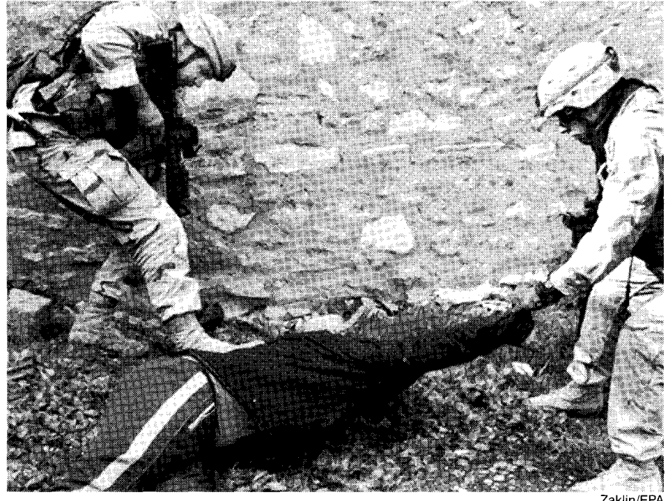
Mosul, 8 January: U.S. troops brutalise a man accused of supporting insurgents