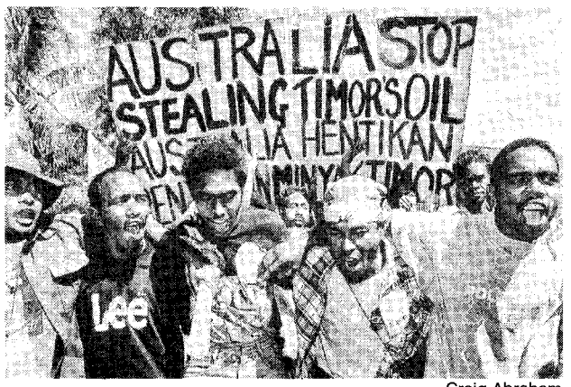
Australian "peacekeepers" in East Timor. Troops enforce terrible poverty, defend subservient regime which acquiesced to massive neocolonial theft of oil resources. Above: East Timorese protest visit by John Howard.

in Aceh is to cement closer ties with the TNI and other Indonesian state forces. A recent example of how these forces function to protect imperialist profit making is seen in the Indonesian operations of Melbourne-based Newcrest mining giant. Part of the $122.9 million in profits raked in by Newcrest in 2003-2004 was extracted from the Toguraci mine on the remote Indonesian island of Halmahera in North Maluku. There, Newcrest have employed TNI and the notorious Indonesian Mobile Brigade (Brimob) paramilitary thugs against indigenous people protesting the rape of their land. In early January 2004, Brimob forces gunned down at least two protesters.