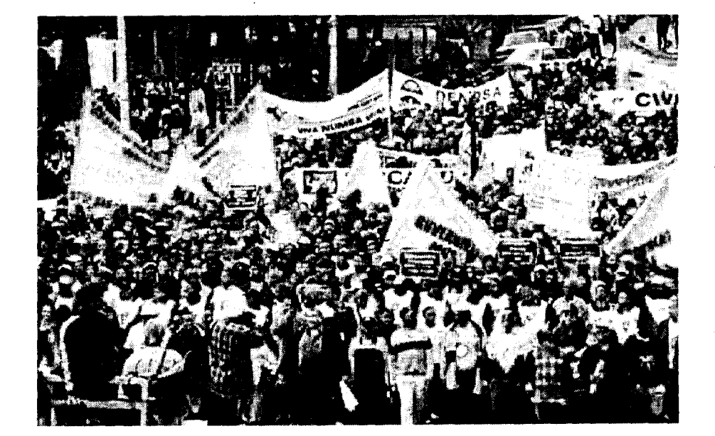
Cape Town, October 1: Mass rally starts the two-day nationwide general strike/stayaway called by COSATU against privatisations.

The backdrop to the attack on the miners is a "black empowerment" takeover of ERPM by black capitalists who used a labour contractor to "implement inhuman working and living conditions," as a National Union of Mineworkers (NUM) spokesman put it. Labour contractors are notoriously used to circumvent union contracts on wages, working conditions and retrenchment issues. The miners had been