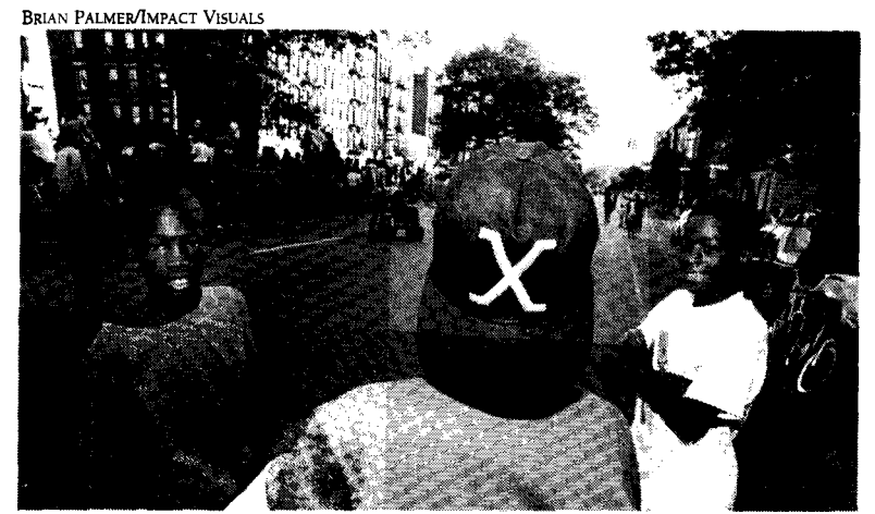
Lessons from Malcolm X Independent Black Political Action

African American Day Parade in Harlem, September 1992.