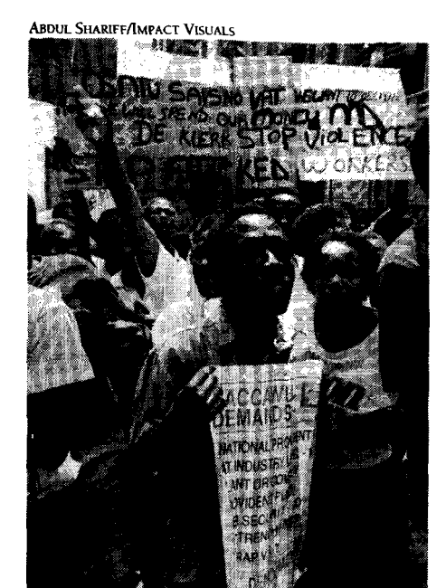
Trade unions are leading the fight to end apartheid. Congress of South African Trade Unions called a National general strike and stayaway in November 1991 in protest of the government's unilateral decision to implement value added tax.