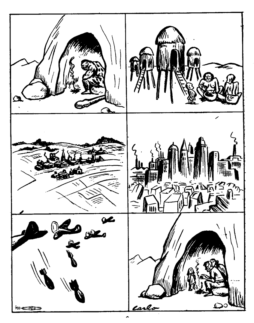
CAPITALISM WILL DESTROY US UNLESS WE DESTORY IT:

That is why, in country after country, capitalism has given rise to fascist or other reactionary dictatorships. That is why you always find capitalists and whole capitalist groups stimulating and financing reactionary and fascist movements. That is why even the democratic capitalist countries adopt more and more reactionary social legislation, anti-labor laws, restrictive laws on democratic