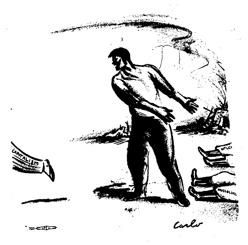
LABOR CAN DO IT!

existence to which capitalism condemns them, forces them, day in and day out, to fight against these very conditions. This fight cannot be conducted consistently nor, in the long run, successfully, unless it becomes a conscious fight against the whole rotten foundation of capitalism and for laying the foundation of socialism.