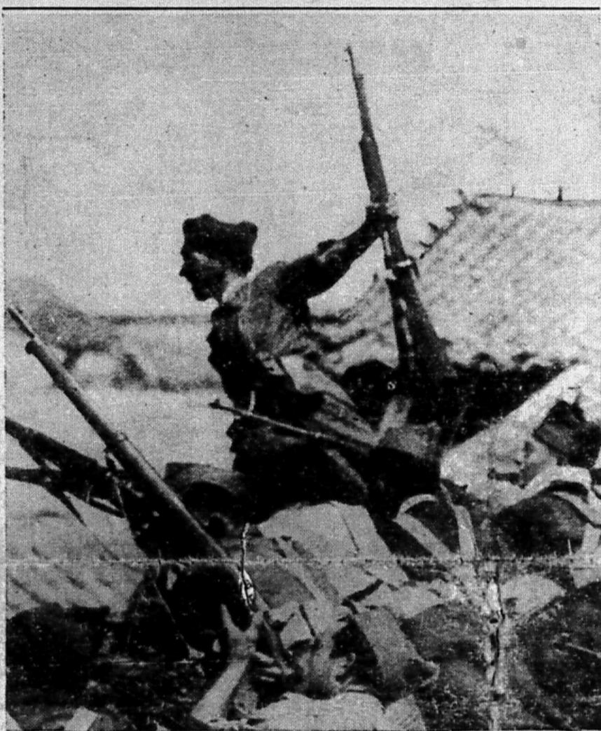
Working class militiamen on guard outside Madrid. Debs Column volunteers will join them in the fight against fascism.

It was exactly eleven months ago that the Youth Act hearings in Washington made the