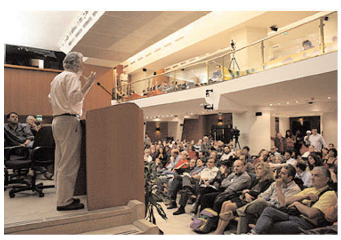
Recent Sinistra Critica conference

This is a subject which is relevant to the whole European left, which has been made a laughing stock by the Sinistra Europea (European Left Party) and its strategy of an organic alliance with social democracy in full knowledge of the fact that the necessary recomposition has to have, more obviously than was the case at the beginning of the 90s, a very clear indication of its working class and anti-capitalist character. Now in fact, shortly after the fall of the Berlin Wall and the dissolution of the USSR, in many matters we acted with the knowledge that it was necessary to "resist" and to recompose the communist vanguard elements that had ties to the working class and wanted to undergo a process of political and programmatic clarification. This period is over. Today the process of recomposition has benefited from several important experiences: the Italian and Brazilian ones, and,