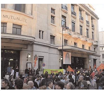
LCR supporters gather outside the Mutualité

During the meeting Besancenot outlined his proposals such as banning job cuts and redundancies, increasing the minimum wage and benefits by 300 euros a month net, building a million council homes and