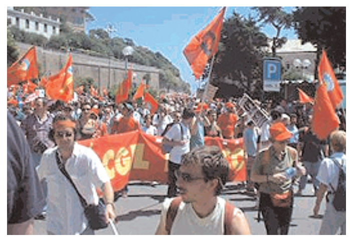
European Social Forum Florence 2002 - high point of the 'Rifondazione period'

Turigliatto) were locked into the political corner where it is only possible to "bear witness" and "be pure and consistent" without any ability to be effective, thus demonstrating the state of degeneration in which the left finds itself today.