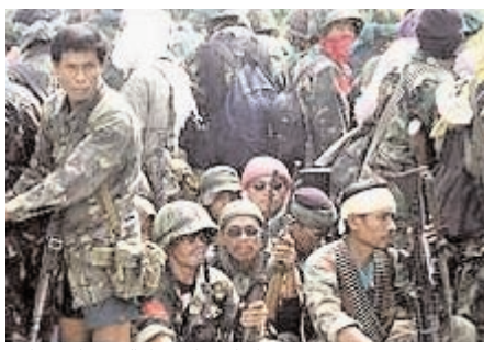
Independence fighters in Mindanao

By such methods were the Moros brought into the Philippine state - an American colony till 1946, then formally independent. They continued to be oppressed and discriminated against politically, economically and culturally. It is easy to understand that they fiercely maintained their own identity and their desire for freedom and it was only a question of time before this broke out in open rebellion. A defining moment was the Jabidah massacre in 1968, when Moro army recruits were massacred by their Philippine army superiors after refusing to take part in the invasion of Sabah, a province of Malaysia with which the Moros have historic links. Armed struggle began in the early 1970s, first of all under the leadership of the Moro National Liberation Front (MNLF), which negotiated a peace agreement with the Philippine Government that led to the creation of the Autonomous Region of Muslim Mindanao (ARMM) in 1996, though