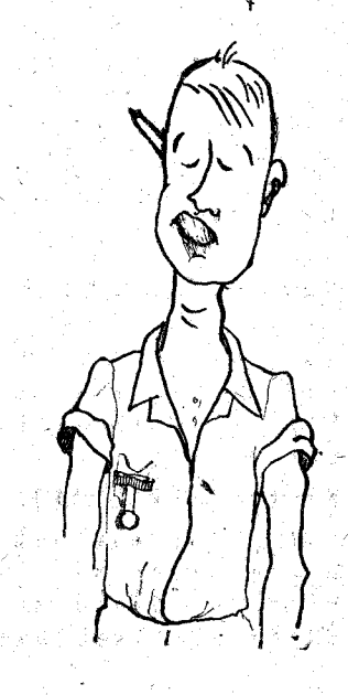
"What do you want to get so friendly with the guys in your department for? You can't better yourself that way."