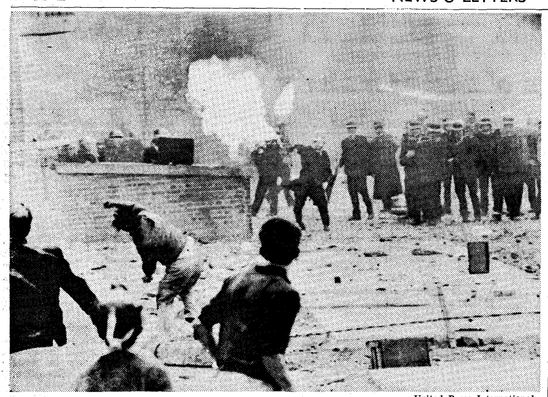
Irish Catholic teenagers in Bogside hurl firebombs at hated Ulster police.