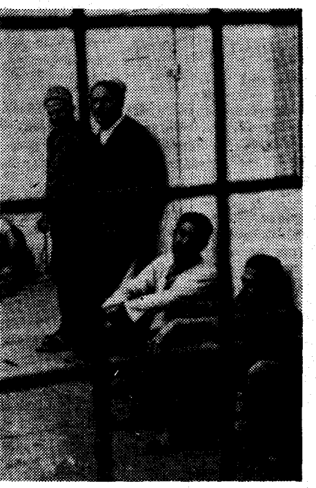
Palestinian prisoners in Israeli jail.

It is widely believed that all this is part of the attempt to annex the West Bank, in clear violation of all existing agreements. Palestinian resistance will continue. It is high time the Israeli people organized a mass movement in the support of Palestinian self-determination on the West Bank