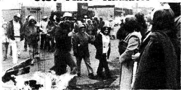
On the picket line at U.S. Auto Radiator. (Continued from Page 1)

you are poor, you don't have the money to go to a doctor and find out. And in first aid sometimes they don't even have a bandaid! They give you masking tape. And if you are really hurt, like getting an arm smashed in a machine, they can't do anything.