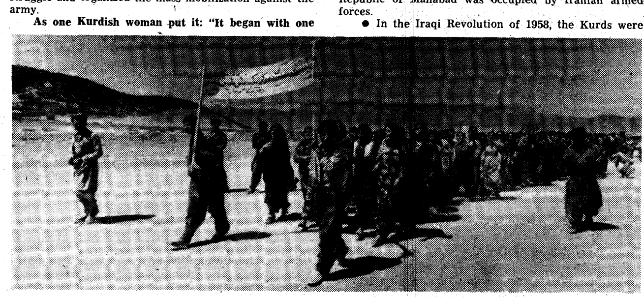
Kurds of the city of Saqqez march in August 1979 in support of Kurds in Marivan who had been encircled "Revolutionary Guards" on orders from Teheran. Banner reads: "The destiny of the Kurdish people can only be fulfilled in a democratic republic of the masses.'

• In the Iraqi Revolution of 1958, the Kurds were