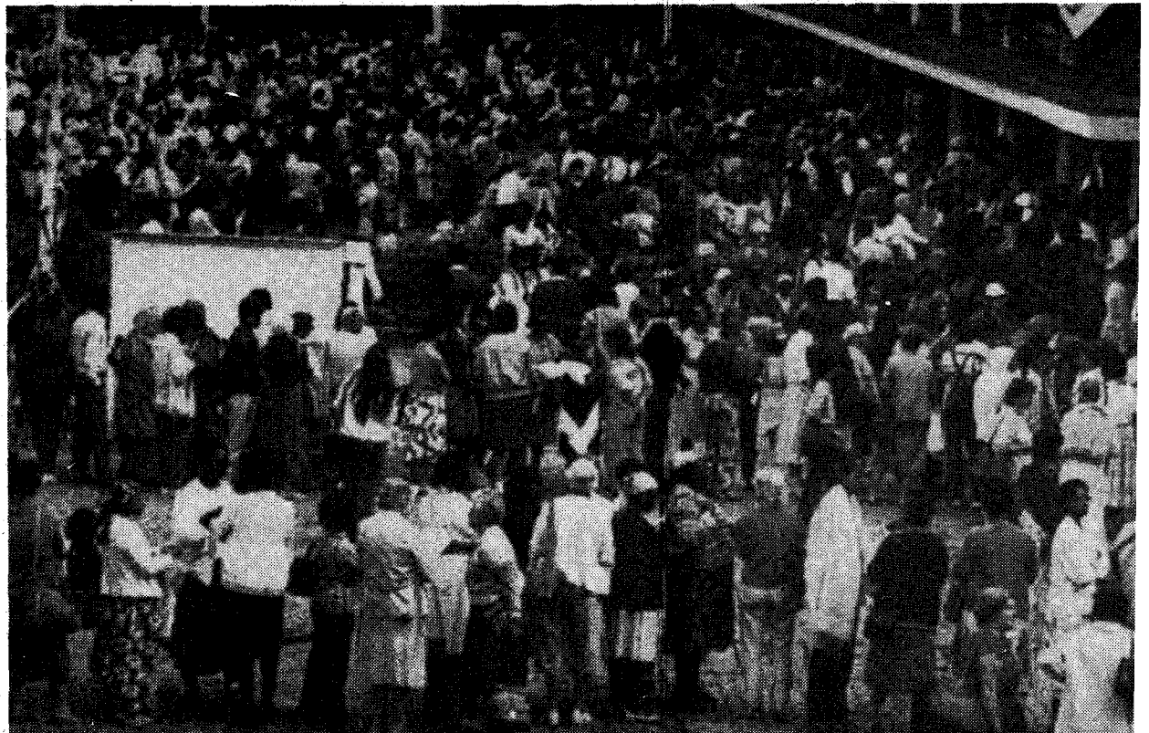
Women in Kenya registering for Forum '85.

THERE IS NOT A SINGLE element of the Black population, in particular, that has not felt the retrogression—whether that be in the increase in unemployment, the abridgment of civil rights, child care, housing, and on and on. Although, in general, the media have given