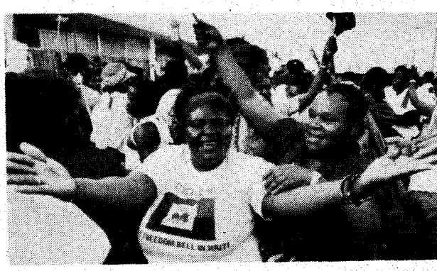
Haitians celebrate the fall of Duvalier in Miami.

By contrast, in Haiti, natural rights meant the end of human bondage by the revolutionary activity of Black slaves. Of course, today, slavery is not an issue, but