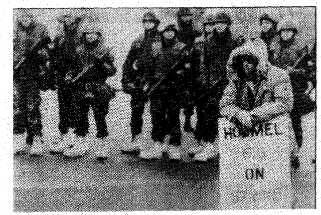
A striking Hormel meatpacker faces National Guard.

flying pickets to other Hormel plants. What most stirred the crowd at the rally was the presence of many of the 500 workers from the Hormel plant in Ottumwa, Iowa who refused to cross the picket line set up by Local P-9 members, which shut down production. Hormel immediately fired them.