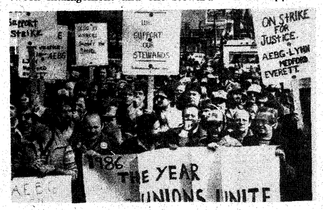
Wildcatting GE workers in Lynn, Massachusetts.

I have seen in my shop the despotic character of socalled American democracy through the relationship between management and one steward who is supported