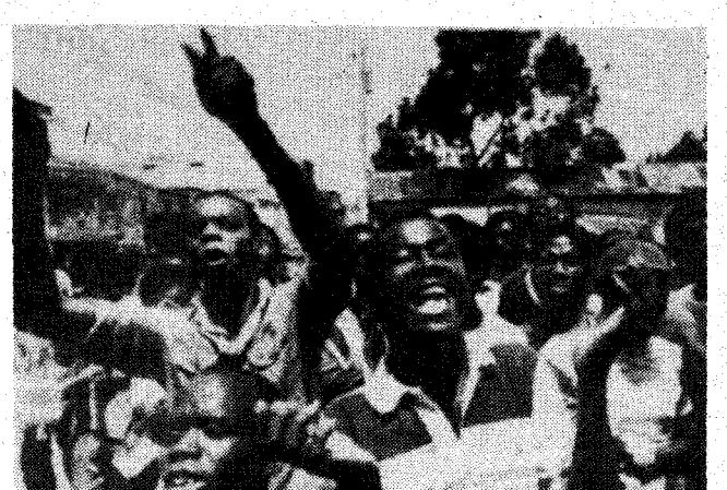
Demonstrations in Port-au-Prince protest interim government.