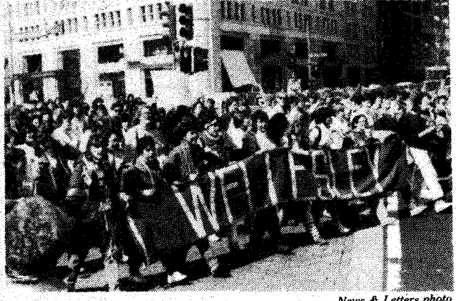
Abortion rights marchers in Washington D.C.

Thus two dozen workers from United Food and Commercial Workers Local P-9 in Austin, Minn. came from the picket lines at the Hormel meatpacking plant, and one woman described the discrimination against women workers there. Along with them marched women poultry workers on strike for two years against Marval Products in Dayton, Va. over working conditions so bad that a Black woman