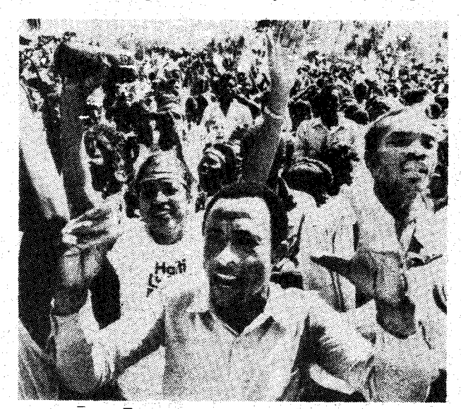
Demonstrators in Gonaives

A split within the rulers also undermined the regime. Jean-Claude had allowed the Army and the old elite a greater share of power in recent years. Today Reagan is