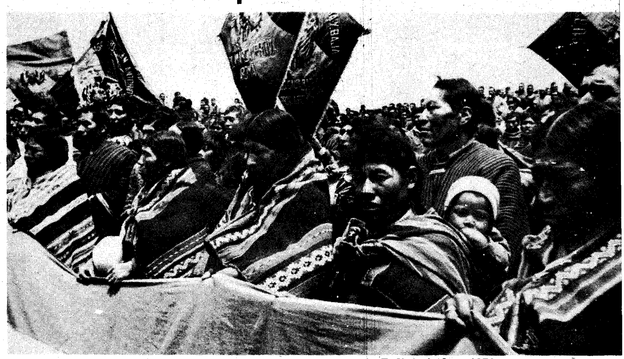
Mass demonstration by peasant union in Bolivia in late 1970s

the Bolivian Revolution created a compulsion for new categories, new ways of thinking, to catch such new realities as integrated, spontaneous worker-peasant struggles. Such a compulsion was in fact created by all the post-World War II era freedom struggles; the 1953 East German revolt and 1956 Hungarian Revolution (with its slogan "Bread and Freedom"), as well as the miners' general strike of 1949-50 in the U.S., created such a hunger for new ideas as to pry from the archives such heretofore ignored writings as Marx's Economic-Philosophic Manuscripts of 1844.