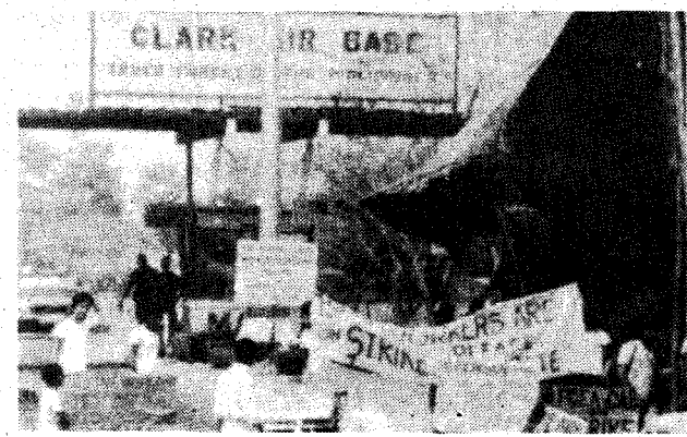
22,000 Filipino workers at Clark Air Force Base and Subic Naval Base are on strike over severance

The first few days of Aquino's presidency were tested by the conservative stance of the military in the policy of releasing the political detainees. In line with Pres. Aquino's policy, more than 500 political