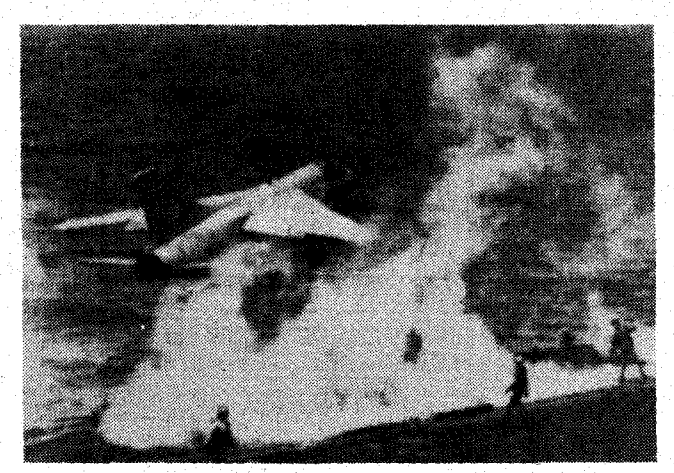
U.S. warplane taking off from carrier in Gulf of