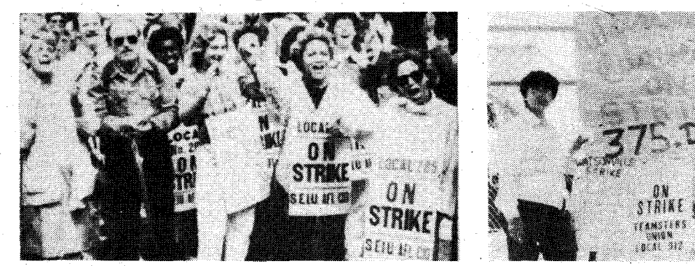
Boston nurses (left) and Watsonville, California cannery workers (right) on strike.