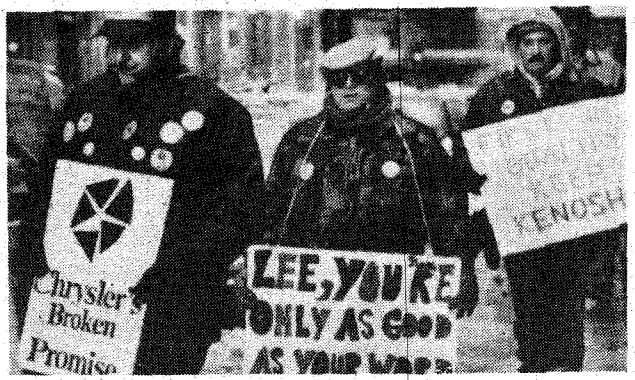
Auto workers from Kenosha Wisc. Chrysler plant picket against decision to close facility.