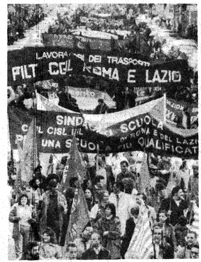
Workers marched in the streets during a nationwide general strike in Italy last November.

The teachers were the first to form Cobas in the 1970s. They decided to leave the traditional unions and form their own unions. By now the Cobas have more