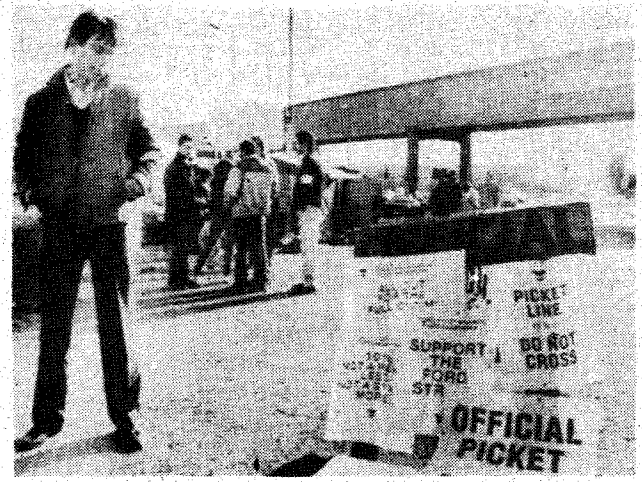
British auto workers on strike.

Over 32,000 production workers at Ford Motor Company of Britain shut down 22 plants in a two-week strike last month, the first nationwide Ford strike in nearly a decade. During negotiations before the strike, the auto workers rejected their union's recommendation to accept wage increases and other benefits in exchange for a three-year contract and management's right to introduce sweeping work rule changes at the point of production-including increased robotization and "quality circles"—on an industry-wide basis.