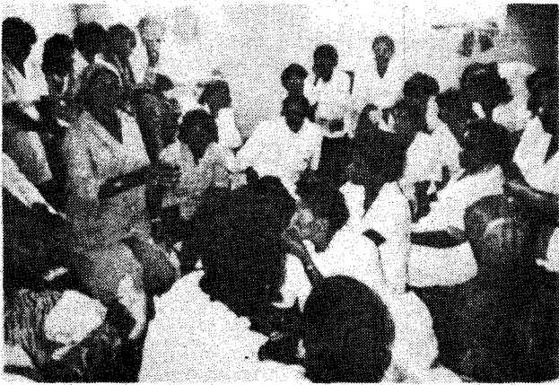
Meeting of Firefite workers in Capetown.

We've just received the October 1987 issue of "Sparky the a newspaper published by the South African Electrical & Allied Workers Trade Union (EAWTU). Their centerfold proudly announces the EAWTU has the "HIGHEST STRIKE RATE IN CAPETOWN OF ALL UN-IONS." These two pages feature pictures and descriptions of 16 strikes they've organized in 1987. The longest strike in the engineering electronics industry in the history of Capetown (at Firefite), led by women, ended September 1987. The strike was won and resulted in the return of all dismissed strikers. The strike also extended into social relations of the workers: "Workers regularly sang songs of hope and struggle. They visited factories, went to the beach, to the cinema, organized fund raising activities, social education programmes, etc. In addition, they worked closely together as a family of strikers expressing concern for each other... Below we print excerpts from other parts of the paper: