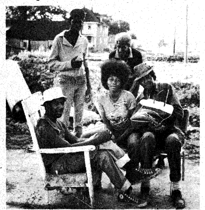
Detroit in the 1980s

Two facts of Black life, on this twentieth anniversary of the Kerner Commission Report, illuminate its utter degradation today—the rates of Black impris-