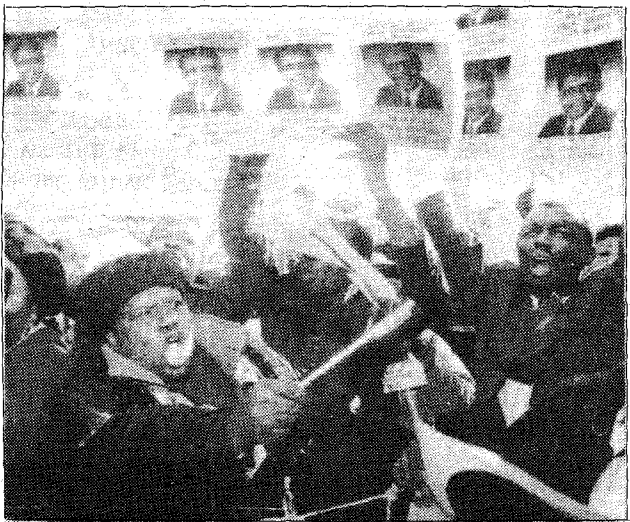
Demonstrator at rally against visit by Boutros-Ghali in Mogadishu.

Both the Somalia debacle and the political burlesque staged by the desperate remnants of Duvalierism in Haiti was all the provocation Clinton needed. In typical jingoist fashion, the Western media made the loss of 18 U.S. troops in Mogadishu the moral equivalent of war (Clinton immediately increased troop levels in Mogadishu from 4,700 to 6,400, with 3,600 marines stationed off-shore), while barely mentioning the killing of 300 and wounding of 700 Somalis, many of them women and