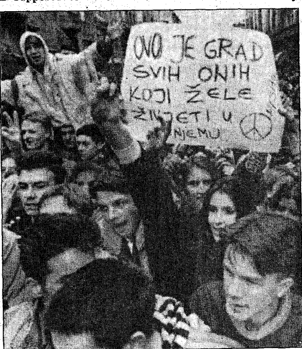
Rally in Sarajevo on Dec. 11 of Muslims, Serbs and Croats for a multiethnic Bosnia. The banner reads "This is the city for all peoples who want to live in it."

Hegel demonstrates the process of transcendence of this unequal relationship by showing how the slave who is supposed to be the inferior consciousness actually