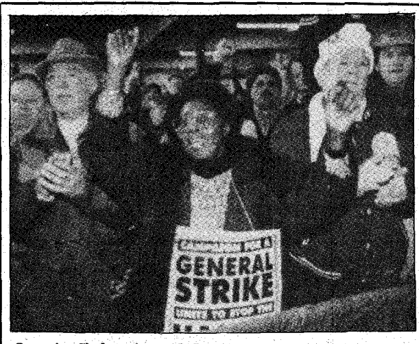
Ontario Federation of Labour workers on general strike in London, Ontario.

Caterpillar and Firestone went back under an imposed contract already. At Caterpillar, they have a recall list of 188 and 17 people were fired in the first week. These were people with a lot of time, fired just to take away their pensions. My neighbor's son says that he is not allowed to talk to any fellow employees while he's eating lunch. They have to just sit there. It's probably just to keep them from saying something to the scabs. If they catch you, they will fire you. —New retiree