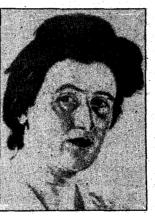
Rosa Luxemburg, self-portrait

t is the need to throw one's whole life on the scales of destiny; it's this passion for revolution; it's the urgency to get out of prison confinement and open entirely new vistas; in a word, it's the need for what Luxembureg called 'staying human,' that characterized the whole of her vision for a new society."