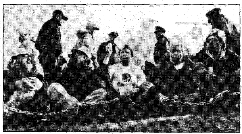
Detroit newspaper strikers and supporters in chains "Shut Down Motown '97" on Feb. 11—even as union leaders prepared to return to work unconditionally.

A manager told me that they get big bonus checks for getting rid of long-term employees, like four elderly white women close to retirement I remember being verbally abused. I'm a single parent and a Church's Chicken recruitment program said the employee they prefer is the single parent — they are easy to mistreat because they have to keep that job.