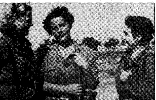
Women defending Madrid, 1936

Invariably, women report solidarity and resistance strategies to preserve dignity and to survive. Paz Azati