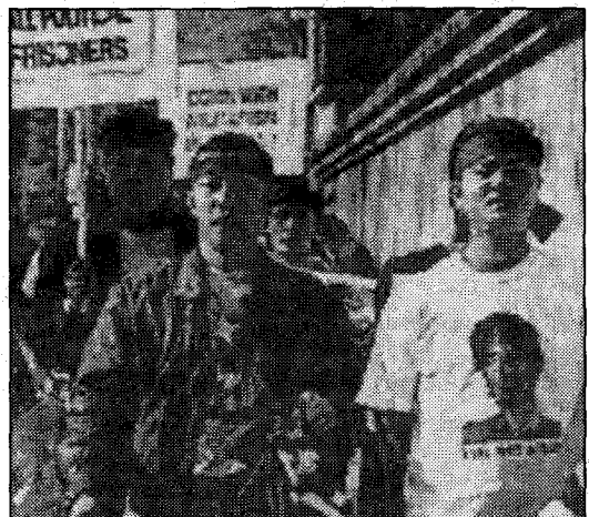
Burmese students in Tokyo protest outside their country's embassy in December.

Revolution is always a matter of life or death for humanity, and the people of Burma desperately need a revolution in order to chart their own path to lives of freedom. Only time will tell if the Burmese masses will surpass both the near-revolution of 1988 and the halfrevolutions which countries like the Philippines and South Africa have undergone.