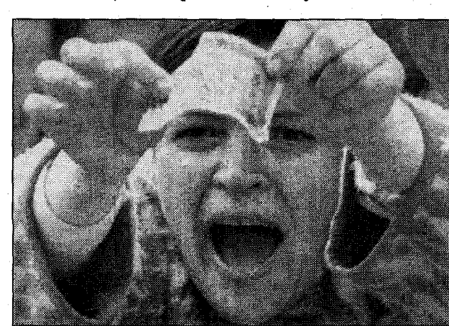
Albanians protest ripoff pyramid schemes.

Asked by a reporter about the notorious Srebrenica massacre of 1995, in which over 10,000 were killed by Serb militias, she responded evasively: "But even that's