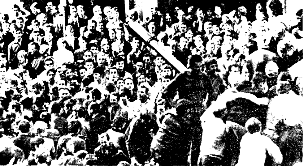
Czechs surround Soviet tank, 1968.

Box 40574, San Francisco, Calif. 94140. WASHINGTON D.C.-BALTIMORE: 1928 Rosemary Hill Drive, Apt. 2, Silver Springs, Md. 20910, or call (301) 585-