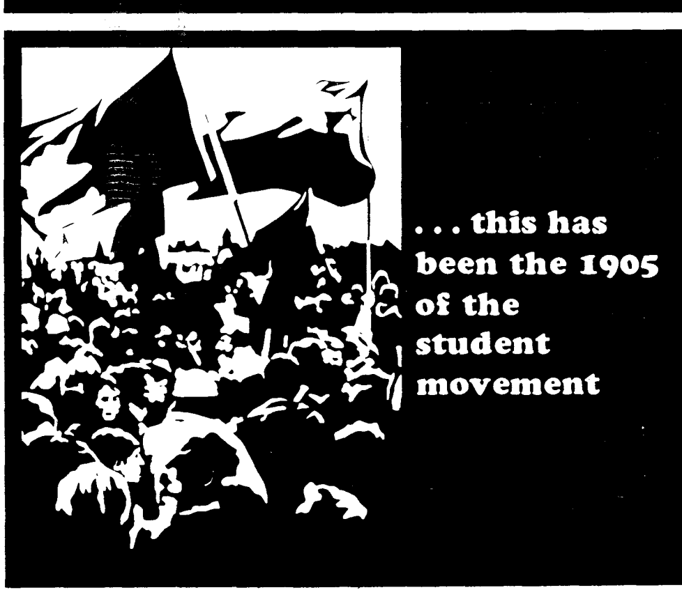
YSA linked post-Kent State student outbreaks to abortive proletarian revolution of 1905 in Russia. The French Ligue Communiste also held a similar position, recently praising student "soviets" divorced from the workers.

majority and minority. The minority, in spite of its current condemnation of the guerrillaist strategy in Latin America, continues to accommodate itself to petty-bourgeois and guerrillaist movements. The U.Sec. minority and the SWP, for instance, refuse to analyze Cuba as a deformed workers state and consequently do not call for a political revolution and the creation of a Cuban Trotskyist party. The SWP's virtual uncritical support of the Cuban Revolution and its current uncritical support of the guerrilla strategy in Africa serve to illustrate that the SWP capitulates to guerrillaism where it does not intrude on its socialdemocratic appetites.