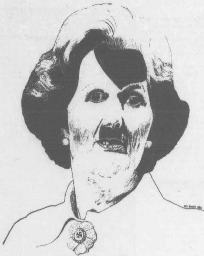
RE-INCARNATION - HEIL THATCHER

As Red Action goes to press, the dock-workers have called a national strike over the use of scab labour to break support for the miners' strike. It must be obvious to all by now that the Coal Board and the Steel Board are taking their orders direct from central government whenever any major decision has to be made. British Steel must have consulted the government before provoking another dock strike. Socialists must draw the lessons from this co-operation amongst our "rulers", if we are to have any chance of reversing their attacks upon the working class. Below we take stock of Thatcherism and suggest how we will beat it.