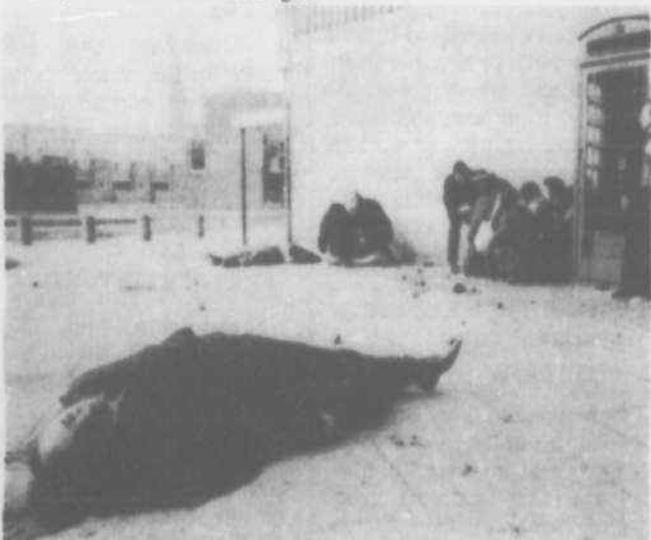
ANOTHER BLOODY SUNDAY?

A short time later an army landrover passed us. One of 'our brave soldiers' provocatively aimed his rifle at me and sniggered.