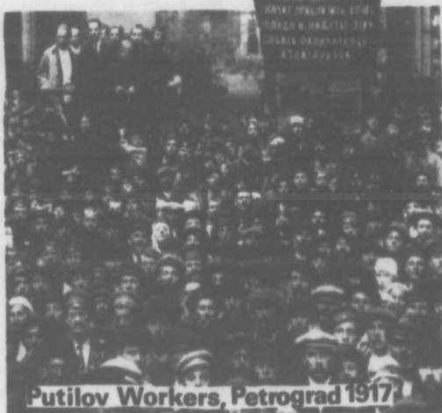
Putilov Workers, Petrograd 1917

The Kronstadt sailors and their supporters rose up AFTER a wave of strikes