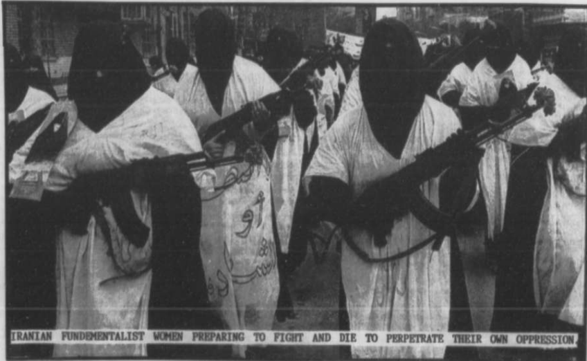
IRANIAN FUNDAMENTALIST WOMEN PREPARING TO FIGHT AND DIE TO PERPETRATE THEIR OWN OPPRESSION.