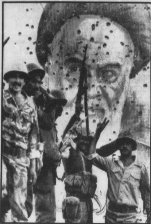
IRAQI SOLDIERS SALUTE IN FRONT OF BULLET RIDDEN MURAL OF KHOMEINI.