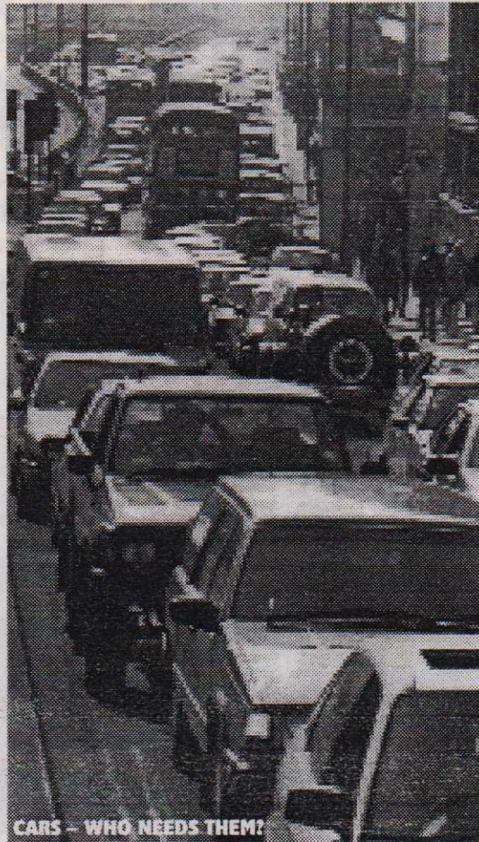
CARS - WHO NEEDS THEM?

But socialists don't call for the scrapping of all technology and industrial production. Revolutionaries want to take what's best from capitalism – like advanced and energy-efficient technology – and then make it even safer, cheaper and more accessible. To do this, we have to go beyond the limits of capitalism and place the working class in control – of factories, science and all planning. It is only the working class which has the aim of saving the environment for today and for all future generations of humanity.