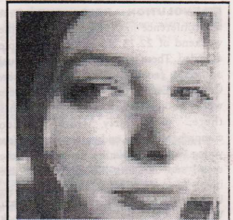
Shock horror! This young woman has a stud in her nose!

Looks like the "Asian Tigers" might soon be a good example to follow after all ... the example of revolution!