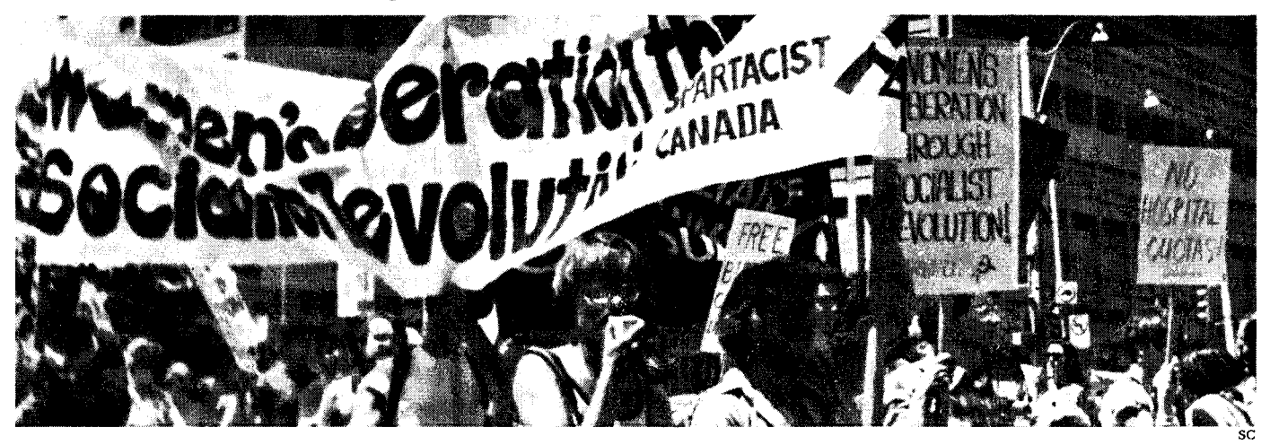
TL BANNER ON MAY 28 ABORTION DEMO.

MAY 28--Over 250 people marched through Toronto today to protest Canada's reactionary antiabortion laws. The action was called by the "May 28 Coalition," a hodgepodge of women's groups, social service organizations and the fake-Trotskyist Revolutionary Marxist Group (RMG) and League for Socialist Action.