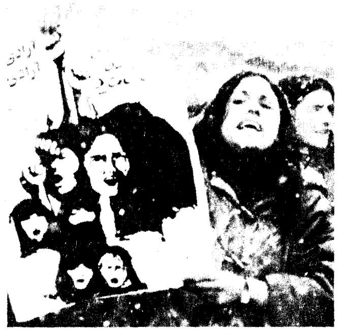
INTERNATIONAL WOMEN'S DAY 1979: TEHERAN

Ten years ago the women's liberation movement was at its height in North America. Tens of thousands of women across the continent flocked to join a movement to fight the institutionalized oppression of women under capitalism. But today the women's movement is practically inert in the face of the widespread and vicious attacks on women's rights that have come with the ever-deepening economic recession.