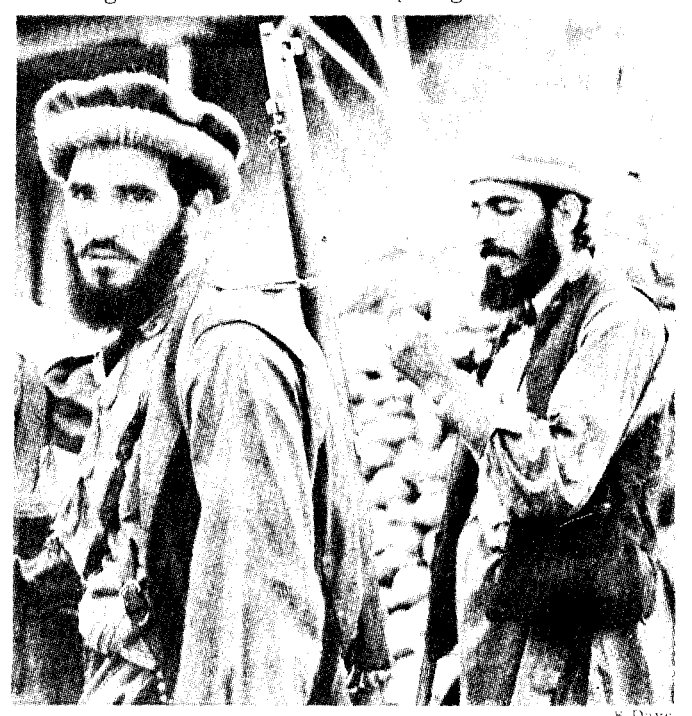
U.S. - BACKED SOLDIERS OF ISLAM

sales of high technology products, such as advanced computers and oil-drilling equipment would be cut off; four Coast Guard cutters were dispatched to Alaska to protect the fish from Russian aggression; scheduled openings of consular facilities were stopped, as were any new cultural and economic exchanges. Carter has since pledged that the U.S.