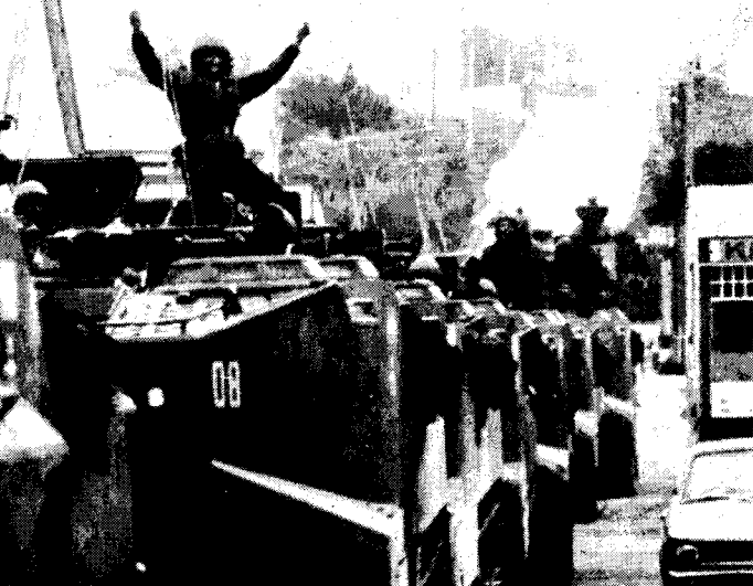
"For God, Country and Anti-Communism!"