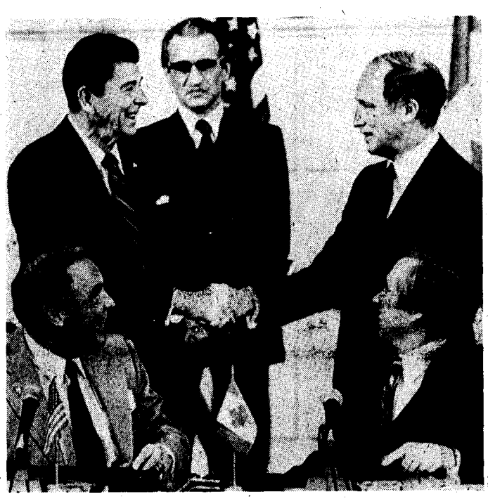
Imperialists target gains of 1917 October Revolution. Reagan and junior partner Trudeau shake on a new signing of joint anti-Soviet defense treaty – NORAD.