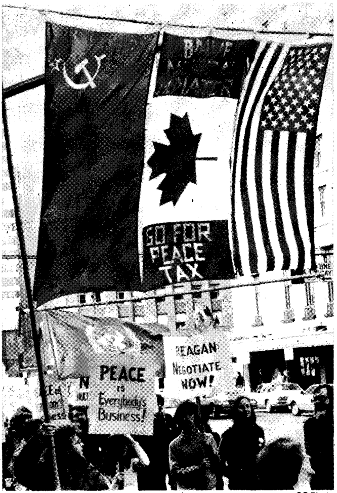
CP's popular-front wet dream, Vancouver, March 6. Banner hails imperialist Canada as "Brave Neutral

The organizers of the "peace" demonstrations want to build a lily-white movement in defense of the "true North, strong and free." They don't want any banners that might be viewed as "too radical." So while