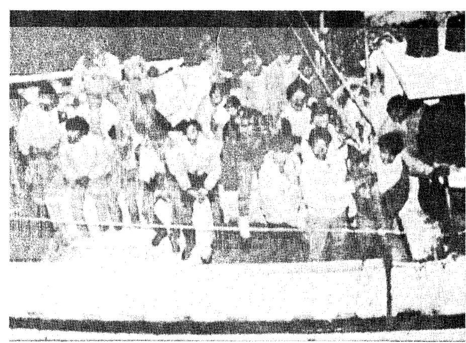
Desperate Tamil refugees rescued off Newfoundland, August 1986. Full political asylum!

On August 11, 155 desperate Tamil refugees, men, women and children, were rescued from the icy waters of the North Atlantic where they had been left to drift in two perilously overcrowded lifeboats. The plight of these refugees has come to symbolize