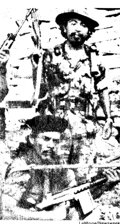
Carpet bombing of Vietnam, Nicaraguan contra cutthroats. Canadian jackal imperialists profit from U.S. dirty wars.

bedtime for Bonzo ditto for their "free trade" deal (after all they can't leave it to Deaver anymore). The only thing that rivals the venality of the Canadian rulers is their unbridled hypocrisy.