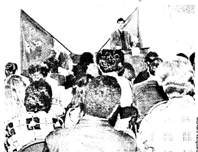
Oakland, Nov. 21, 1986: Spartacist forum "Fight Reagan Reaction with Class Struggle!"

On November 21, the Spartacist League was compelled to take the very unusual step of changing at the last minute the location of its public meeting from Dwinelle Hall on the University of California