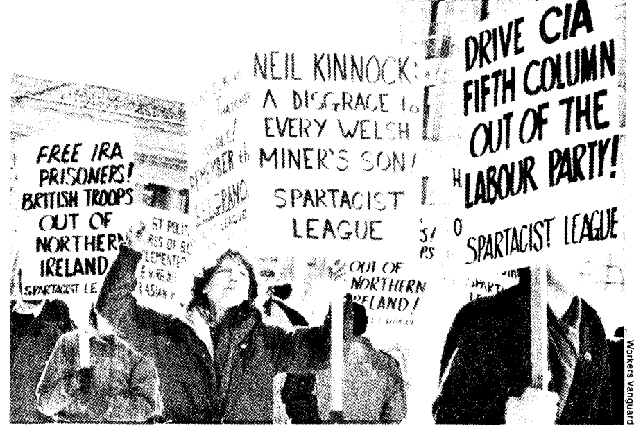
Washington, D.C.: SL/U.S. pickets protest British Labour Party scab leader Neil Kinnock.

The pro-NATO, anti-Soviet social democrats of the NDP are cut of the same yellow cloth as Kinnock. They also share the ever-so-righteous, hypocritical moralism and fealty to "Her Majesty." The British media was particularly intrigued by our Spartacist placard calling for the abolition of