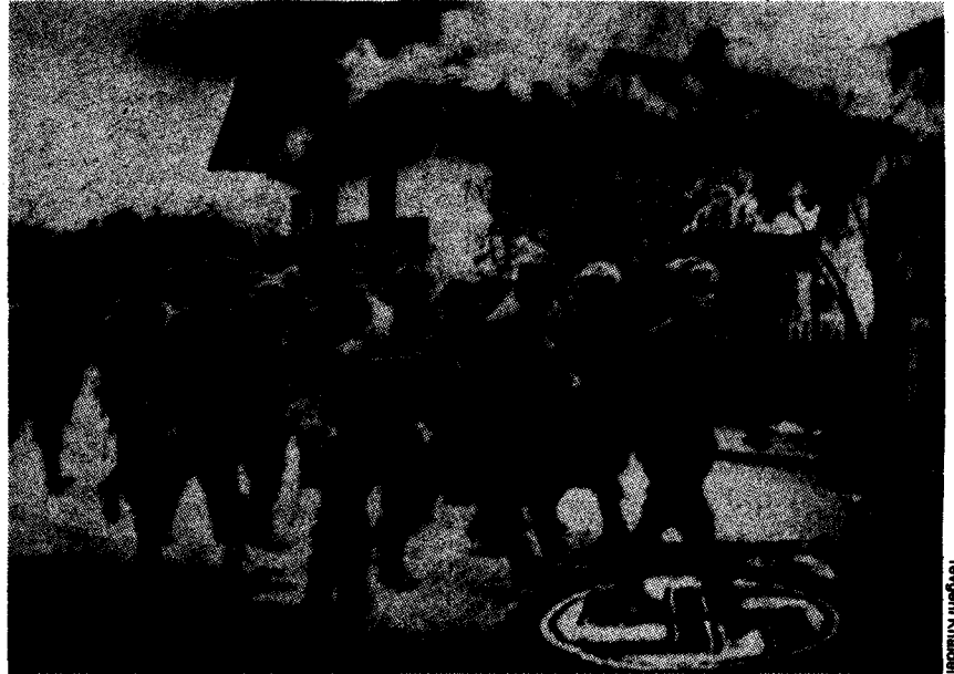
Soviet Red Army liberates Central Europe, World War II. Defeated Nazis found safe haven in Canada.