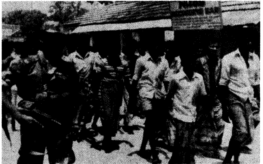
Sri Lankan army rounds up Tamil youth in Jaffna Peninsula. Canadian rulers threaten to deport desperate Tamils to torture and death.

The racism and anti-communism at the heart of the government's "illegal aliens" scare was driven home last February when immigration cops ransacked a number of Tamil homes in Toronto, warning that "As refugees you should not read communist