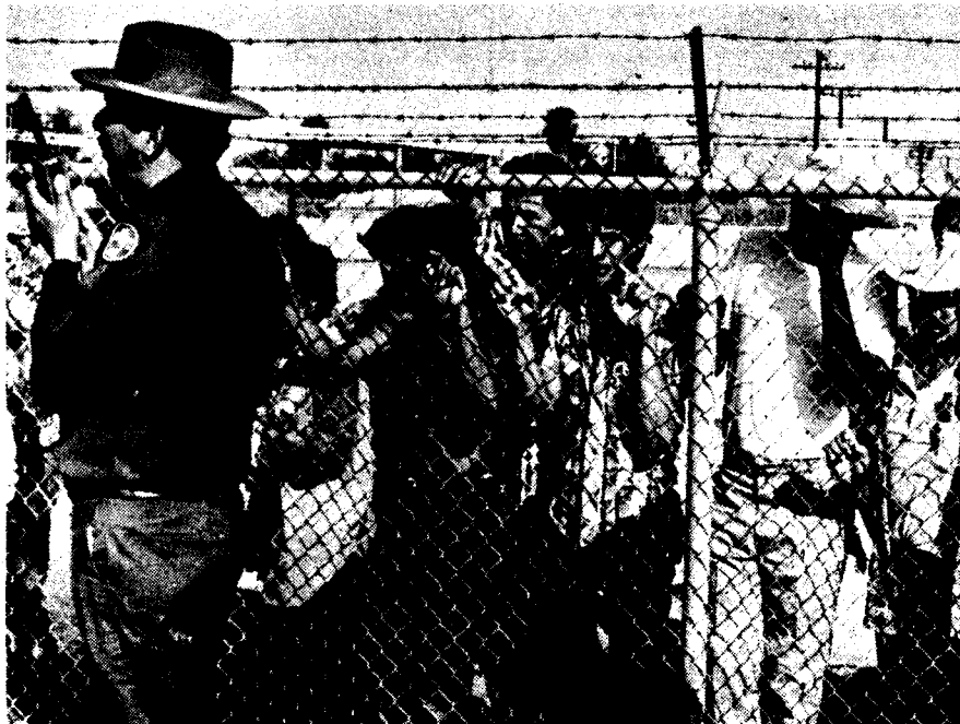
Salvadoran refugees in California concentration camps face deportation to death. Canada says U.S. is "safe."

All the talk about "abuse" of refugee status and "illegal aliens" supposedly "stealing Canadian jobs" is complete hogwash. Refugees and immigrant workers are overwhelmingly concentrated in the lowest paid and dirtiest jobs that no one else will do. As a series of articles in the Montreal Gazette reported, they work in the sweatshops of garment, textile