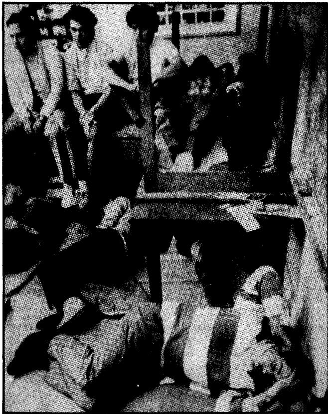
Montreal, March: Chilean refugees on desperate hunger strike to demand entry to Canada for their families. Racist Canadian government had defenseless women and children dragged off planes and stranded on the streets of Argentina.

From Afghanistan to Nicaragua the Canadian rulers are the loyal backers of the Reaganauts' drive to "roll back Communism." Fear of revolution in