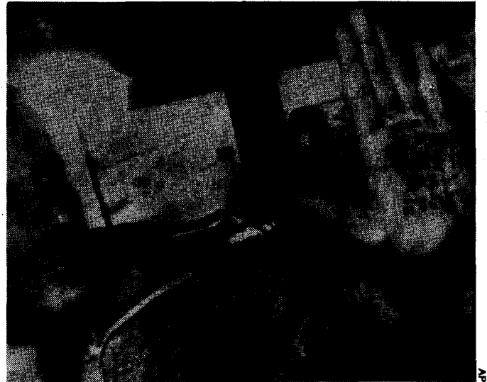
Jerusalem, December 1986: Courageous Israeli nuclear technician Mordechai Vanunu flashes message to reporters from police van saying he was hijacked in Rome by Israeli agents.

In the intensely chauvinist Zionist fortress, governed by the "Labor"-Likud alliance which includes the entire Zionist spectrum and is presently headed by notorious terrorist and murderer Yitzhak Shamir,