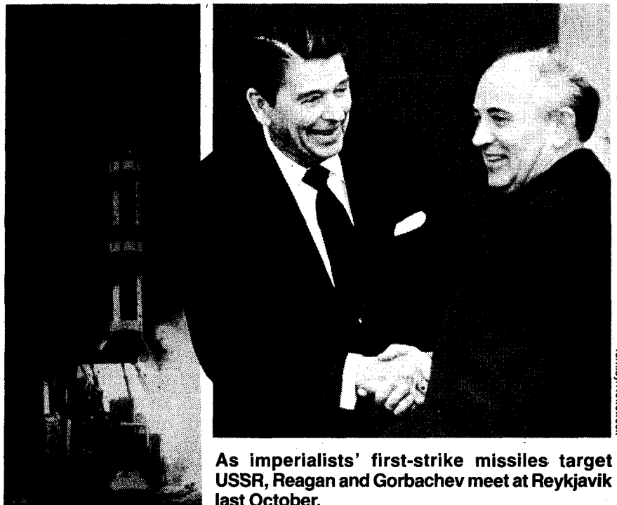
As imperialists' first-strike missiles target USSR, Reagan and Gorbachev meet at Reykjavik last October.

Instead, Soviet leader Mikhail Gorbachev holds out his hand to the rabid warmonger Reagan as a partner in securing "world peace." Business Week (16 March) breathed a sigh of relief: "Just as the Iran- contra scandal was laying waste to the Reagan