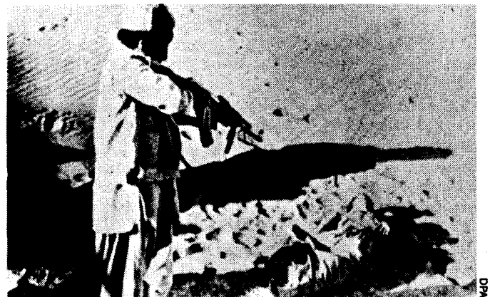
Imperialists' "freedom fighters": Islamic cutthroats in Afghanistan shoot schoolteachers for teaching young girls to read.

But the imperialist war drive against the Soviet Union is bipartisan, including the Democrats as well as the Republicans. "Arms control" honcho Adelman summed up the immediate aims of the "Reagan doctrine": force Moscow to end "the Soviet occupation of Afghanistan, the continuation of military support of regimes in Angola, Cambodia and Nicaragua" ( Washington Post , 13 November 1986). In other words, the arms race is being used as a means of pressure on Russia to surrender Afghanistan to the CIA-armed Islamic fanatics, abandon the heroic Vietnamese people who inflicted upon American imperialism the greatest defeat in its history, let the racist butchers in South Africa take over Angola, and cut off support to Sandinista Nicaragua against Reagan's contras.