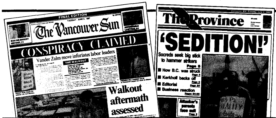
B.C. bourgeois press hysteria backs Socred war on labor.

The Socreds won't be stopped in the courts or the halls of the legislature but on the picket lines. The only "illegal" strike is one that loses. A powerful flexing of labor's muscle would reverberate across the country. In 1981, B.C. phone workers electrified the labor movement when they occupied every key