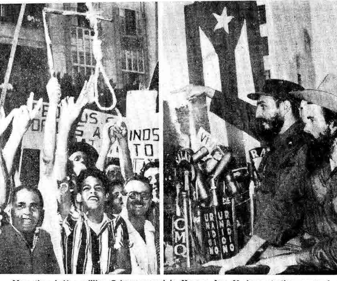
More than half a million Cubans massed in Havana Jan. 26 demonstrating approval of trials of Batista gunmen. One man held rope aloft as symbol of the penalty earned by torturers and assassins. Fidel Castro told rally that protests in Washington against executions were "infamous."