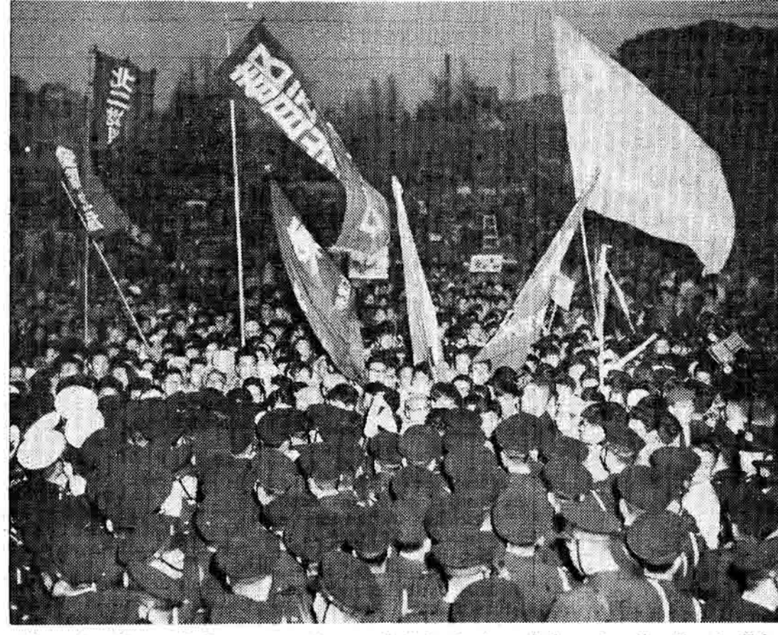
Some ten thousand Japanese workers and students stormed through police lines in Tokyo Nov. 27 to demonstrate before parliament their opposition to the new Japan-U.S. "Security" Pact to be signed in Washington this month. According to story printed below, a group of students expelled from the Communist party for "Trotskyism" led the demonstration.