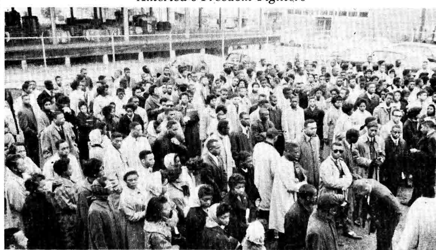
Held in a stockade for parading against segregation in downtown Orangeburg, South Carolina, these college students waited several hours in 40-degree weather to be tried for "breach of peace." About 1,000 students from Carolina