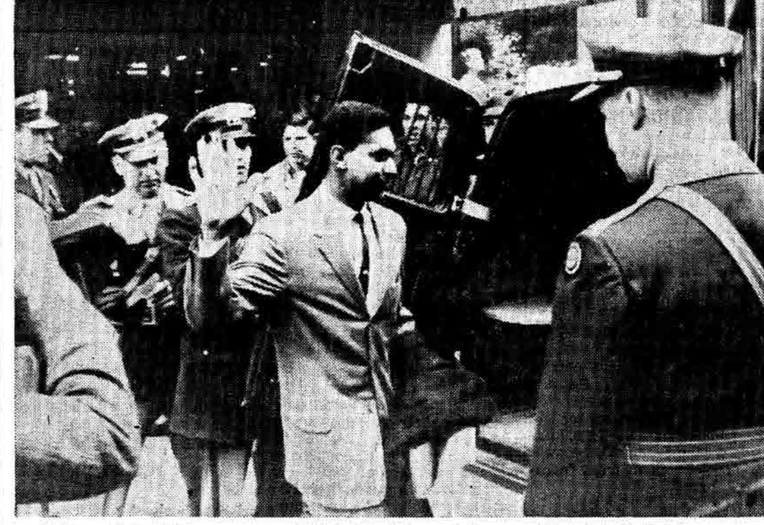
Richmond, Virginia, cops arrested thirty-five Negro students on Lincoln's Birthday as part of racist attempts to crush the struggle for civil rights. The students were charged with "trespassing" by owners of Thalhimer's department store for protesting against segregated lunch counters.