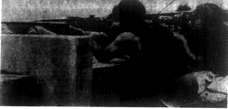
U.S. Marine sniper in action at Beirut airport.

Consequently, skirmishing between the Phalangists and Druse and other Muslim militias resumed before the ink was dry on the agreements that supposedly brought "peace" to Lebanon last summer. Israeli