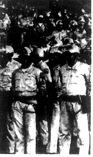
Hundreds of police and National Guardsmen protected scabs when Phelos Dodge reopened its Morenci mine.

It is only natural that many workers driven to the wall by the combination of government cutbacks and company attacks are looking to the Democrats for