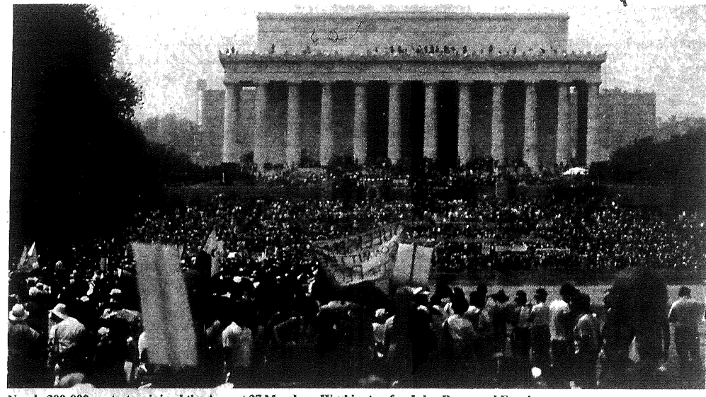
Nearly 300,000 protesters joined the August 27 March on Washington for Jobs, Peace and Freedom.

Both the peace/anti-nuke organizations and groups organizing against the U.S. war against Central America were a major part of A gust 27. The Mobilization for Survival, for instance, acted as the official march transportation committee in several cities. Thousands of the marchers came because of their involvement with peace groups. And a representative of the anti-U.S. forces in El Salvador spoke at the gathering site rally Saturday morning.