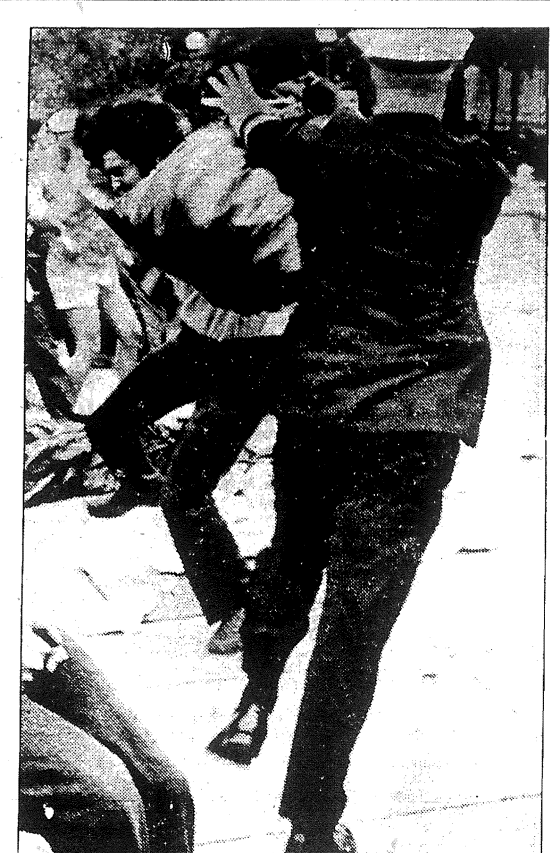
Striker tangles with cop in Baltimore, where public employees paralyzed city in July walkout.

The coal companies, aided by skyrocketing coal prices, may come up with a fair-sounding offer and either avoid a strike or provoke a relatively short walkout. Even if this is the case, the miners will set an example for the rest of the labor movement, showing what even simple trade union militancy can do. If a strike is called and it turns into a serious confrontation, the impact may be electric. The miners may then become the rallying point