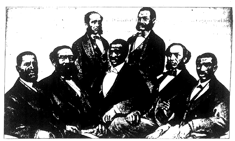
Reconstruction governments, leaning on the southern black "freedmen," were dispersed by the alliance of northern and southern capitalists.

Southern industry is still characterized by the dominance of labor-intensive industries. Textiles remains the largest single employer, while those old favorites, pulpwood and lumber, still loom as major regional enterprises. And, though the South over the past quarter-century has grown at a faster industrial clip than has the nation as a whole it is still far behind the national average in the degree of its over-all development. Though no longer predominantly rural, the proportion of its total population which lives in rural areas is around one and a half times the standard of the U.S. at large. Its per capita income is only 80 per cent of the