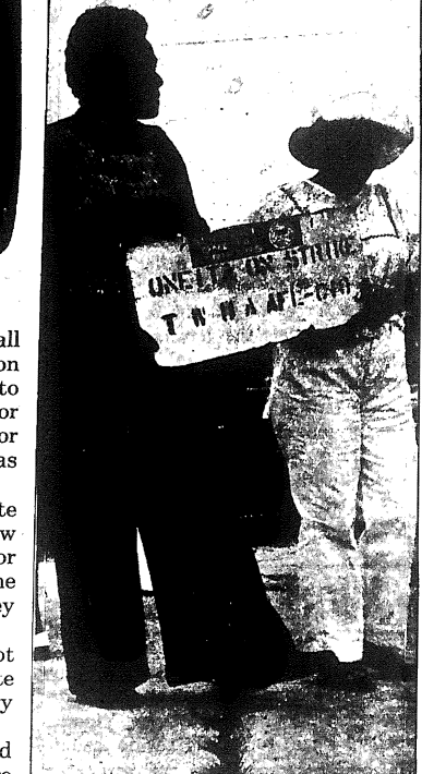
and white workers fueled the Oneita strike.

The Oneita struggle is, in many respects, indicative of fundamental trends in the class