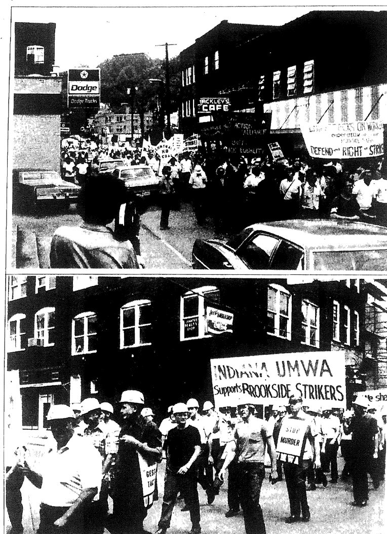
Miners mass in Harlan County, Kentucky in defense of embattled Brookside strikers. UMW holds key to spreading strike wave.

The miners have always been among the most militant sections of the