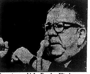
Teamsters chief Frank Fitzsimmons wants to bring back wage-price controls.

The end of the post-war boom has made this role more essential than ever. Inflation, shortages, declining productivity of labor, and overextension of credit plague the domestic economy and have plunged the nation into recession. The international position of the dollar is unstable; indeed, the economic supremacy of the U.S. is