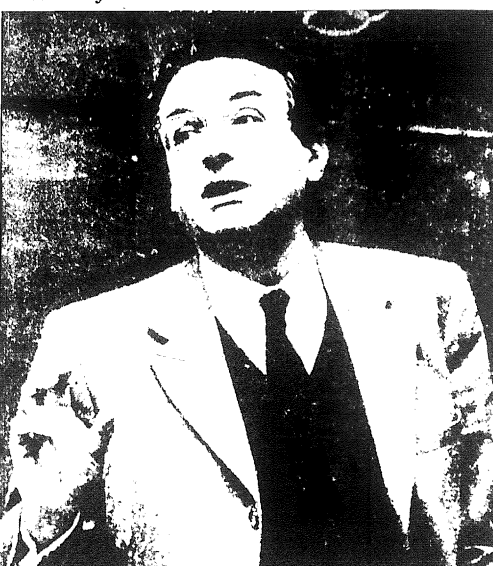
Ernest Mandel, the embodiment of Pabloite opportunism.

The entire document, in short, stakes everything on defeating the bourgeoisie through short-cuts avoiding a revolutionary, programmatic fight for leadership in the working class. Short-cuts like these only shorten the road to disaster.