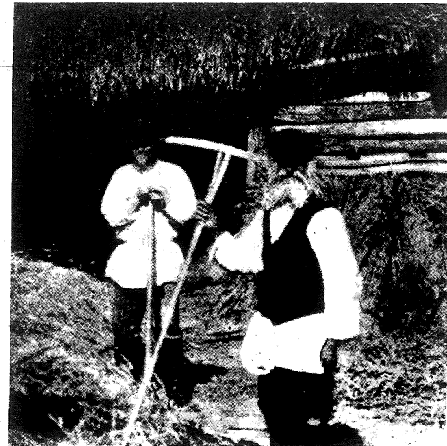
Russian peasants before 1917 revolution.

Within this basic framework, there were crucial differences between the Bolsheviks, led by Lenin, and the Mensheviks. The Mensheviks believed that the coming revolution