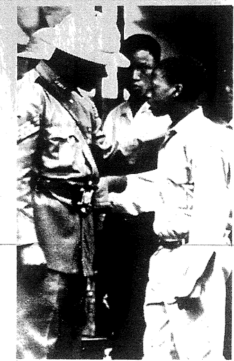
Cop checks passbook, Johannesburg.

The Bantu Education Act (1953) was designed to enforce African servitude. Most advanced subjects were banned, and teaching was to be in tribal languages rather than English, the language used by most Blacks in the cities. This was part of a deliberate attempt to revive dying tribal divisions. The Minister of Native Affairs (and