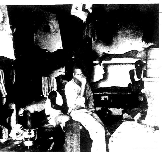
ig in South African miners' compound.

But the most significant political event of 1960 was the Sharpeville massacre. The Pan-Africanist Congress called demonstrations on March 21, 1960, against the pass laws. The rallies were peaceful, with the leaders prepared for arrest. Several thousand