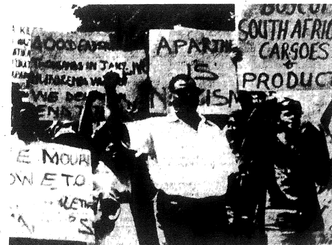
Workers march in Tanzania to protest South African apartheid.