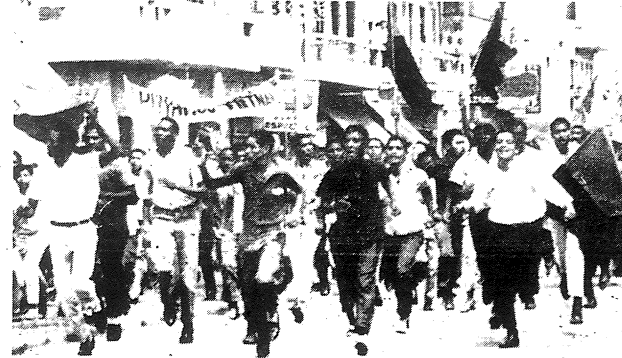
Anti-U.S. demonstration in Santo Domingo

The revolutionary forces were penned in and on the defensive. They were cut off from supplies and in dire straits. As the months passed, victory appeared increasingly remote. In late summer, Caamaño agreed to end the rebellion and accepted the installation