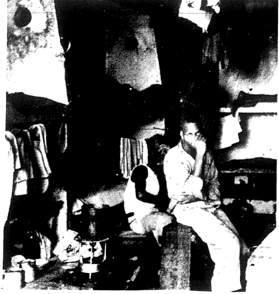
Housing in South African miners' compound.

But the most sigevent of 1960 was the sacre. The Pan-Africalled demonstratio 1960, against the palies were peaceful, wi pared for arrest.