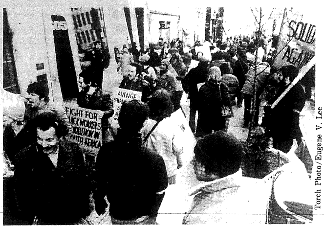
RSL/SCAA contingent at March 26 CAA de onstration, New York City.

the world. Jimmy Carter and Andrew Young are taking up the same line and beginning to include South Africa as well: they want some cosmetic reforms of the apartheid system to derail the revolutionary struggle and to maintain