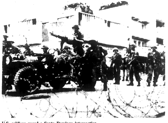
U.S. soldiers guard a Santo Domingo intersection

The 1965 Revolution was touched off when a group of junior army officers launched a revolt against this military junta and seized Santo Domingo, the nation's capital. The aim of the officers was to bring back Juan Bosch. They gained the jubilant support of the population.