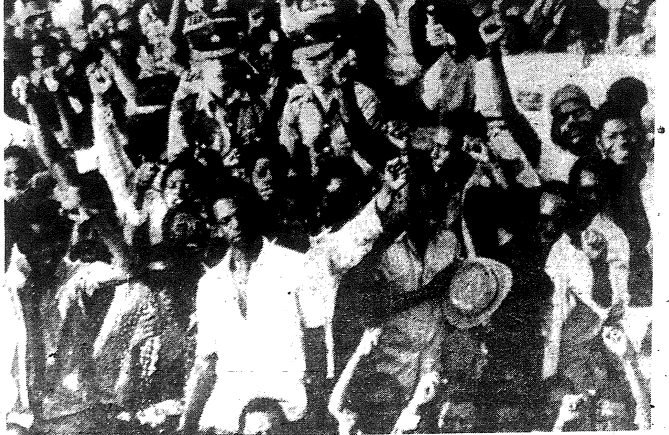
Zimbabweans demand independence in Salisbury demonstration last summer.

This round of the struggle in southern Africa has barely started and it will be several years before it has run its course. The revolutionary party does not exist, but there is still time to build one. \Box