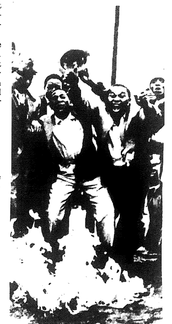
Passhooks hlaze in 1952 Defiance Campaign

They also cannot reform the system, no matter how much they want to (and they don't want to). If they were to do away with apartheid (not merely give it a face-lift) they would