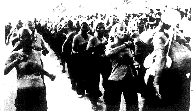
Women march in Luanda, Angola, to celebrate independence from Portugal, 1975.

Zimbabwe. In early 1976, the revolution turned south-wards, and the guerrilla the imperialists fear the most. All of the different plans the Western imperialists have for keeping Africa under their heel depend upon (Continued on page 12)