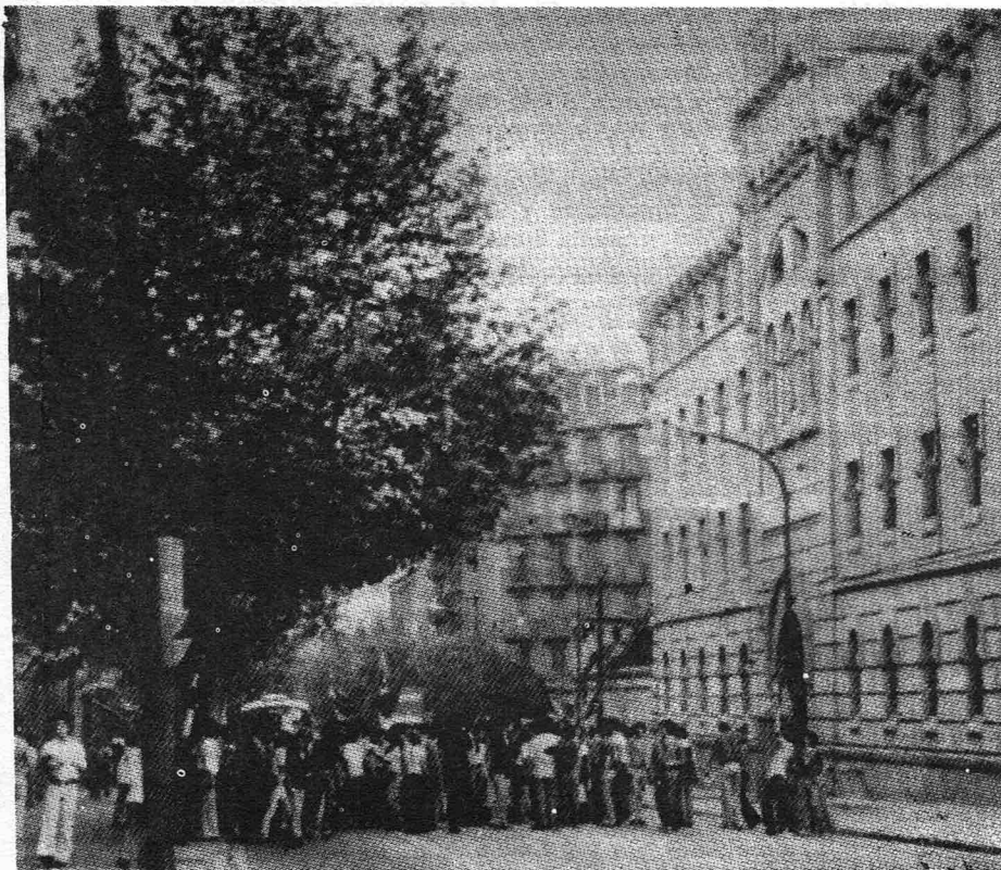
DEMONSTRATION IN FRONT OF MODELO PRISON, BARCELONA

July 9, 1977 Adopted, with 4 votes against and 14 abstentions.