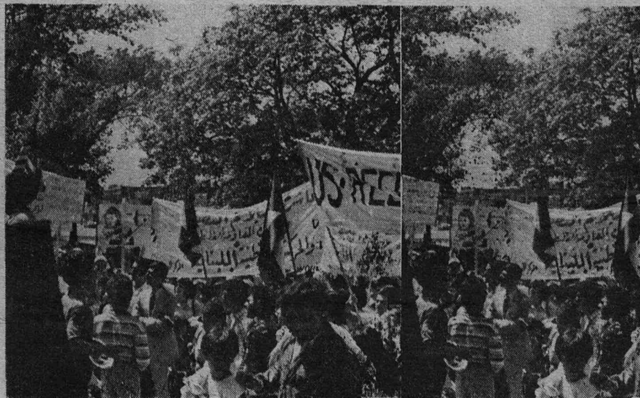
May 15, 1977 Palestinian demonstration in Detroit.

We condemn the latest act of mass murder committed by the Zionist regime of Israel. On November 9th, Israeli airplanes bombed and killed over 100 people, primarily women and children, in Southern Lebanon. This act of conscious genocide is nothing new for the racist, Zionist regime of Israel.