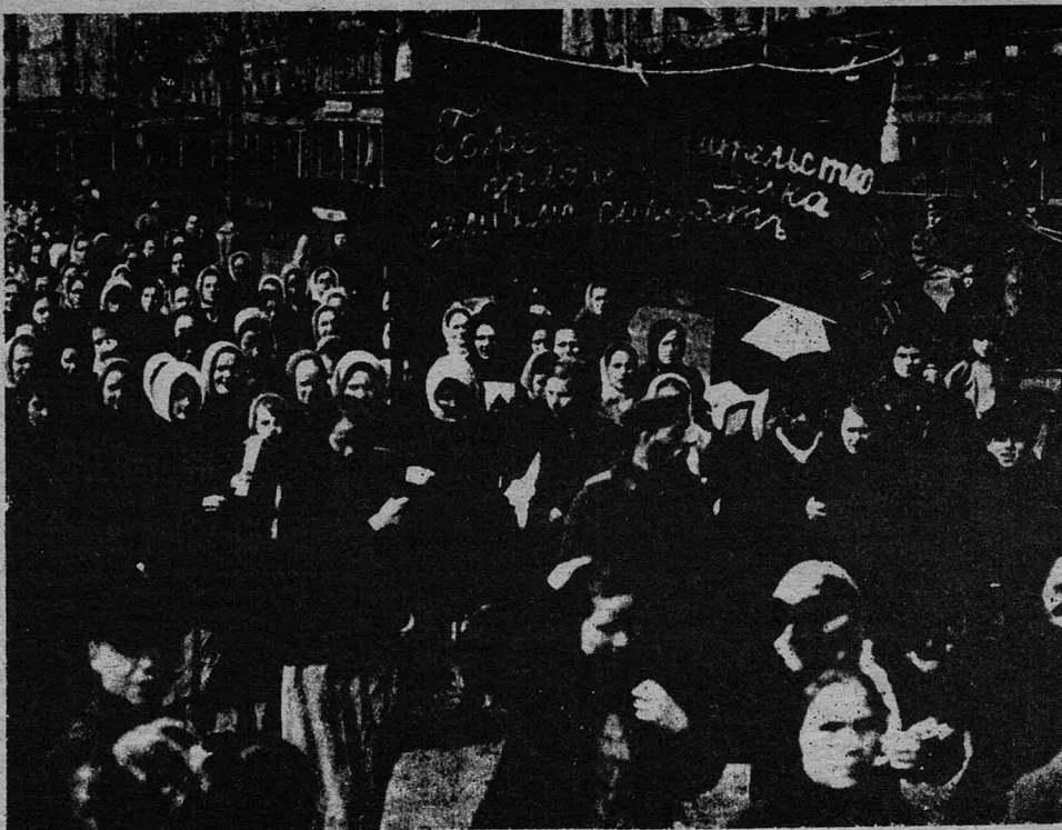
Russian women march in Petrograd, under the leadership of the Bolshevik Party

FOR THE ENTRY INTO POLAND OF THE COMMISSION OF INQUIRY AGAINST REPRESSION. December 1, 1977