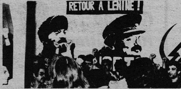
WORLD CONGRESS OF 4TH INTERNATIONAL Paris, France August, 1978

The weakness of the International under these conditions and the consolidation of the counterrevolutionary Holy