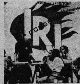
WORLD CONGRESS OF RYI Paris, France Aug. '78

The crisis produced a split in 1953, with the Trotskyists forming the International Committee of the Fourth International. From 1953 to 1972, this body carried on the fight for the Fourth International,