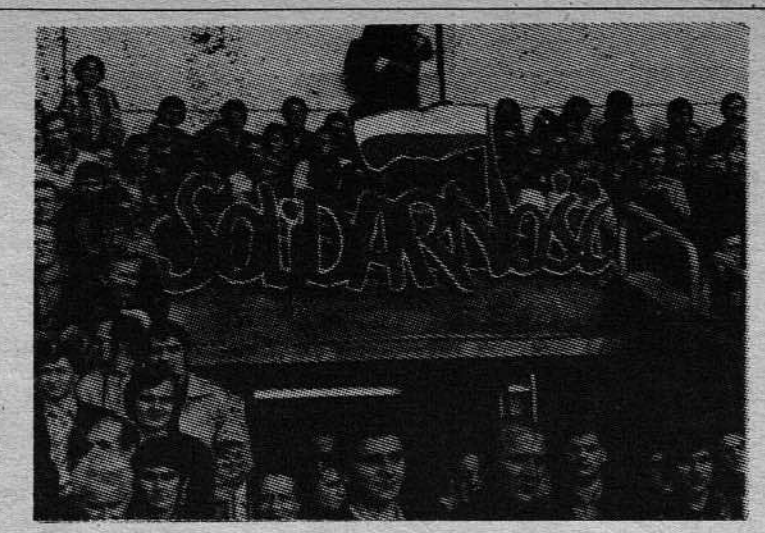
Polish workers, members of "Solidarity."

The defense of the Polish Revolution means now more than ever the building of the revolution throughout Europe. Is this remote from us? Not at all. When we organize against Reagan we are taking up that fight. In particular, in the unions we can take up the fight for the General Strike and, immediately, support to the U.S. tour of the Soviet free trade unionists, Fainberg and Borisov.