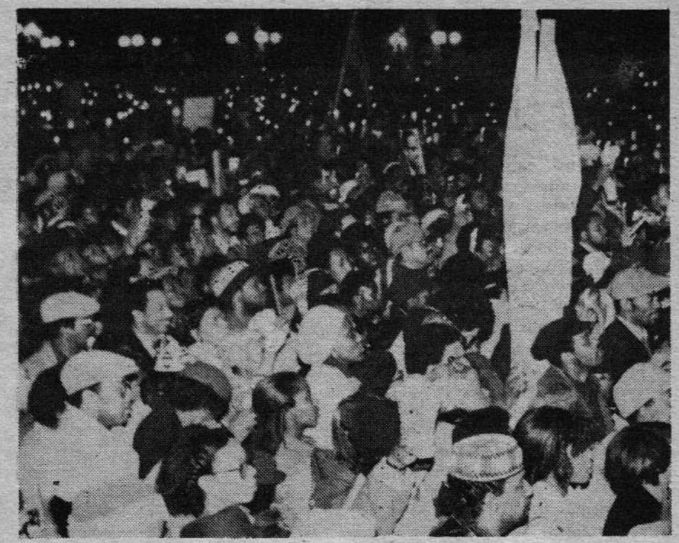
Harlem rally of 10,000 against Atlanta killings.

At the same time, one of Reagan's closest allies, Sen. Strom Thurmond of