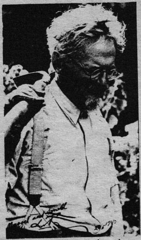
Leon Trotsky. His party is under attack.

The SWP has access to many political and organizational channels and could win militants and workers to a fight against the Voorhis Act. If to militants of the SWP to whom we have talked, a fight against it seems difficult because this law appears on face value to be obscure, it is because no fight has ever been waged. (The SWP only mentions it in passing.) It is the only real way to defend the SWP and all other working class organizations from FBI/CIA harassment and from the legal repression of working class organizations. A mobilization based in the unions with written resolutions raising the issue of the Voorhis Act, its reactionary, anti-working class nature and calling the unions to action, can win unions and sections of unions to this combat in the form of demonstrations, forums, rallies and publications widely distributed in the anti-draft movement, the Latin solidarity movement, and among all youth organizations sympathetic to the struggle of the working class.