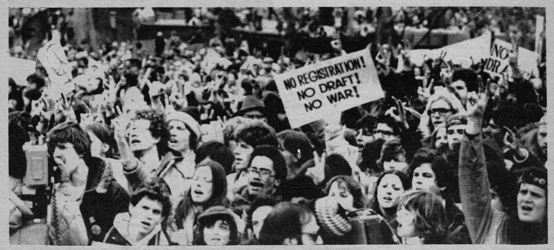
The movement of the youth is in the streets against the rearmament of imperialism.