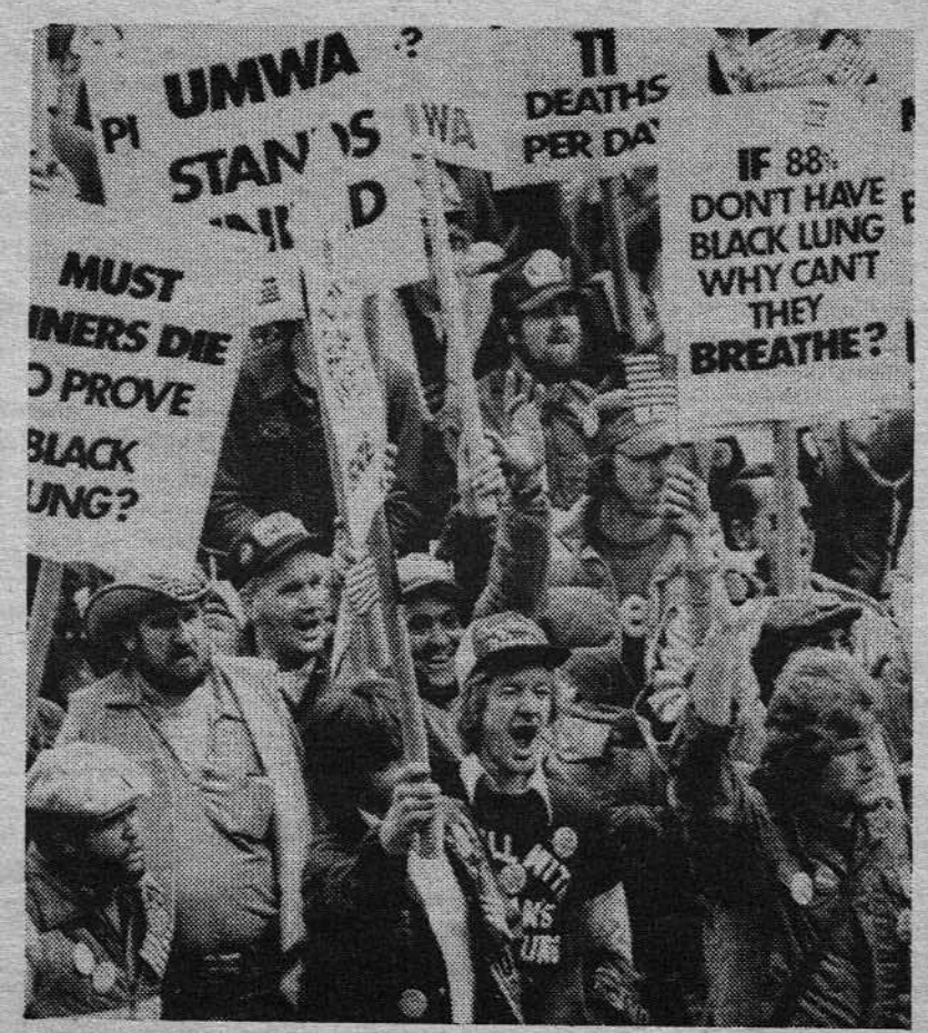
Miners at demonstration against Reagan.

The bottom line is the need for a complete change in the relations of the unions to Reagan's plans.