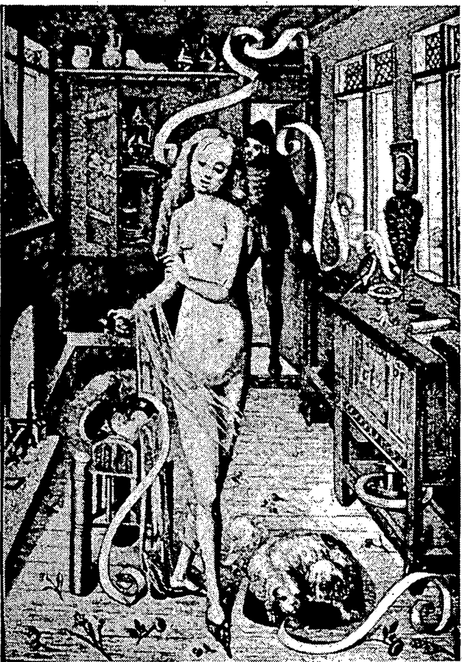
"Love Potion" by an unknown master of the Flemish school in the mid-15th century. The scrolls symbolize the sing-song of the witch's incantation.

But while belief in witchcraft within primitive and modern societies alike increases as a result of social catastrophe and pessimism, this is clearly inadequate as the sole explanation for 400 years of terror. As the historian H.R. Trevor-Roper points out, the craze gathered force before either the Black Death or the Hundred Years' War had begun and continued for two centuries after they were over-centuries marked by