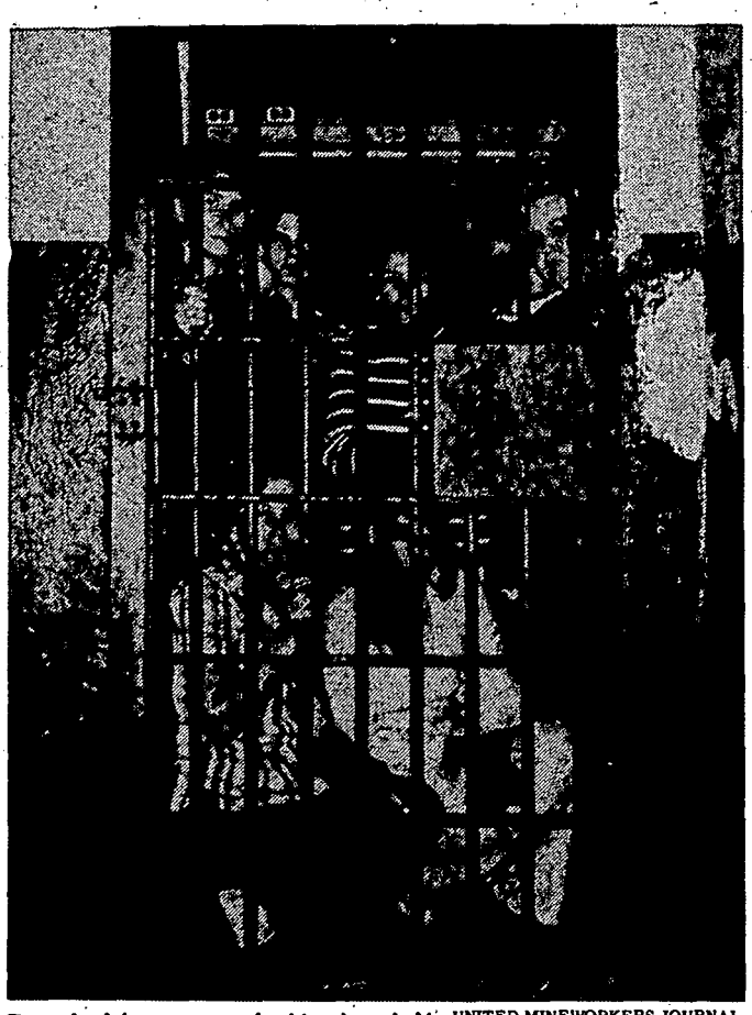
Brookside women in Harlan jail.

During negotiations the company insisted that any contract it signed had to contain a no-strike provision. Furthermore it demanded deletion of the fundamental contract clause that all mining and coal preparation was to be performed by UMWA miners. Promotion was to be based on "ability" as opposed to seniority,