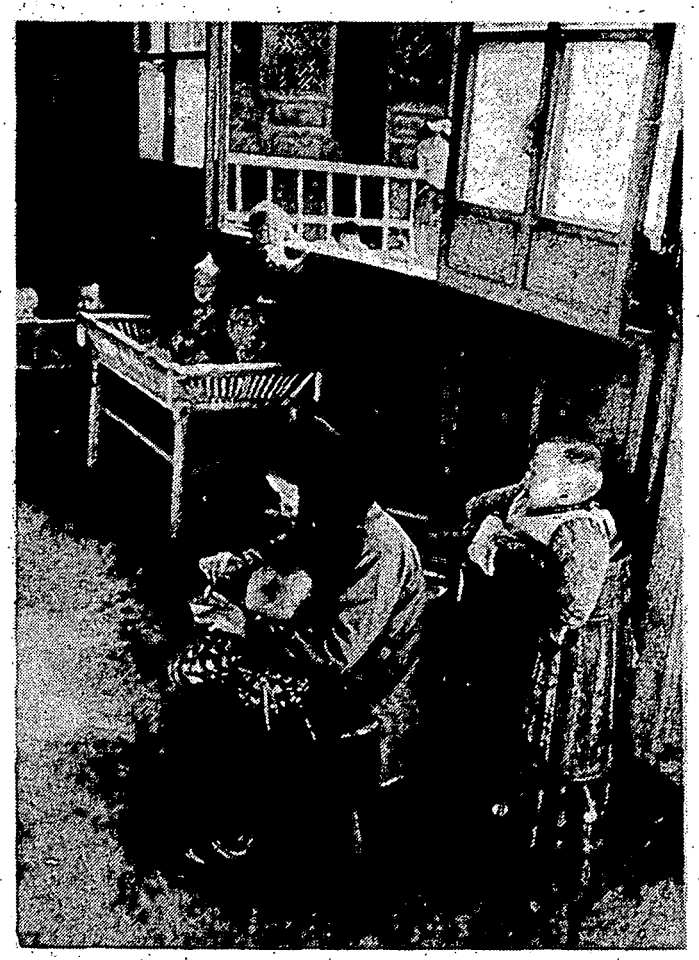
A Chinese nursery school for peasant children.,

As in all degenerated and deformed workers states (including the Soviet Union, Cuba, North Vietnam and