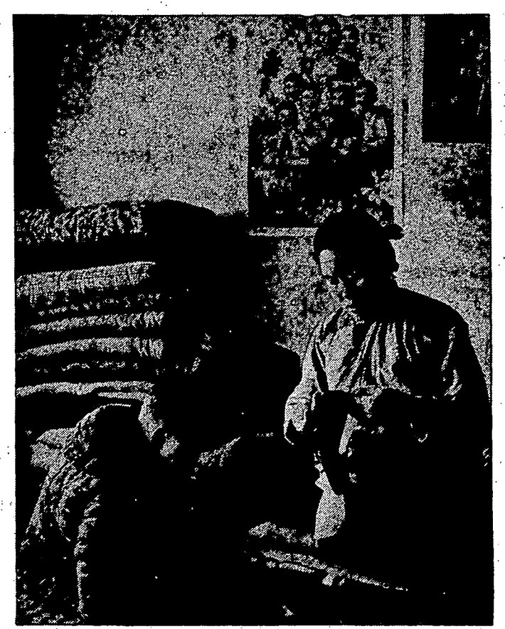
Mother and child in the "new" China. Notice the wall poster which proclaims the joy of motherhood.

Regarding the question of orientation to the Coalition of Labor Union Women (CLUW), differences similar to the ones above also emerge. The OL went whole-hog into CLUW, taking up many bureaucratic posts and submerging any independent presence. Their sharpest criticisms have been leveled at the Spartacist League for raising a class-struggle program in CLUW, with milder criticisms of the Communist Party and the Socialist Workers Party, which stand slightly to the