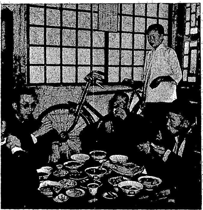
Peasant meal. Today, as in pre-revolutionary times, the family is central to Chinese society.

But despite this attempt at peaceful coexistence between Maoists and feminists, there are serious unresolved differences between them. That these differences have often remained suppressed is due largely to the dishonest approach of the Maoists, who take pains to conceal their politics. The most outstanding of these differences centers on the question of the family, a question on which Maoists hold a po-