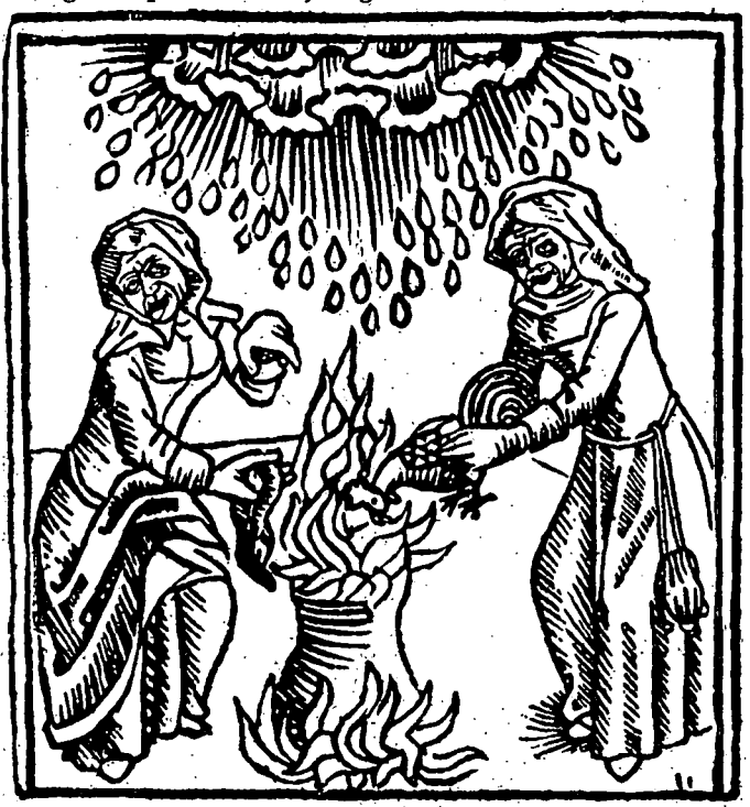
"Witches Bringing a Shower of Rain" by Ulrich Molitor.

Voltaire could afford to joke for he had the good fortune to live at a time when such jokes no longer led inescapably to the Inquisition and the stake. The witch craze, along with other mass forms of fanatical religious persecution, began to dissolve in both Pro-