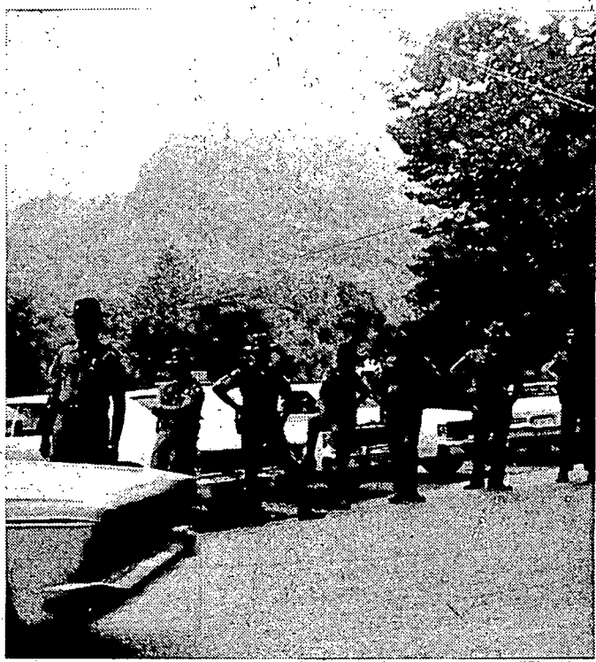
State troopers at Highsplint.

Some of the Brookside Women speak with a hint of nostalgia of their days on the picket line. They regret the demise of their club and would like to reconstruct an on-going organization to do strike-support work where needed and to generally aid the UMWA organizing drive in eastern Kentucky. They would like to maintain the solidarity and community with their fellow workers, the broadened horizons, bred of their collective effort for a cause they strongly believe in —trade unionism, a decent life for working people—