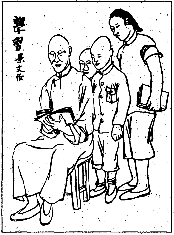
The traditional, patriarchal Chinese family.