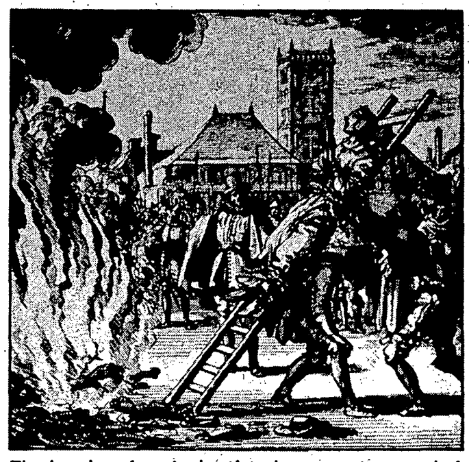
The burning of an Anabaptist who was not accused of witchcraft by Jan Luyken (1571).

While the Church was formally opposed to these relics of paganism which continued to exist alongside