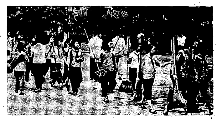
OPERATION BROOM BRIGADE. These youngsters have been assigned to keeping Canton clean.

7. The facilities to socialize housework are still lacking. Child care in the countryside is inadequate, communal dining facilities are unattractive and collectivization of household tasks is not encouraged. It is, of course, true that the productive forces in China are not adequate to accomplish all this even if it