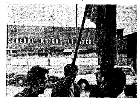
FREMONT - (FRANCE) On the line with French-GM assemblers carrying red flag.

ized. Nationalization without WORK-ERS CONTROL is not a full solution!