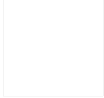
Thatcher: always caring and sharing?!

The gist of what she said was this: "What kind of people do you think we Conservatives are? What kind of a party do you