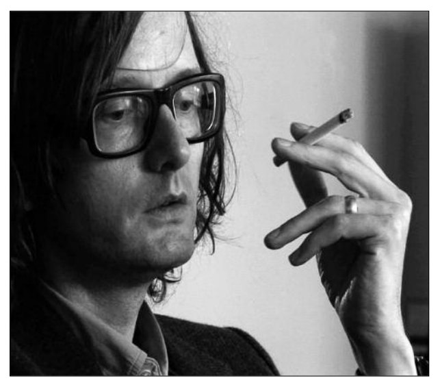
Jarvis Cocker: tales of working-class life... and more

So with Pulp's announced reformation, are we inheriting a band which will serenade the class struggle? Perhaps. Cocker is a slippery, intriguing character, whose musical output is sporadic and hard to pin down. Maybe it's a mistake. If it is then enjoy Pulp's back catalogue, which has some nuggets of gold songs that depict the drudgery of working-class life and calls for the emboldening of and the realisation of the potential of the working class.