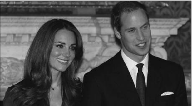
WillnKate. We hope they will be deposed

So our task is to be churlish. To laugh and expose the sham of monarchy's mystique. To throw verbal bricks at their spectacle. To puncture the cant about one nation coming together to celebrate a fairy-tale wedding. To offer instead of a place as extras in the publicly-funded festivities of the House of Windsor a leading role in the alternative festival of the oppressed.