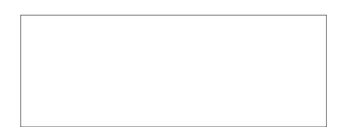
Egyptian Brotherhood on the march