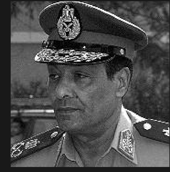
Field Marshal Mohamed Hussein Tantawi is now in charge in Egypt

Military threatens strike ban; solidarity campaign launched: page 5