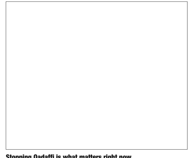
Stopping Qadaffi is what matters right now

Today, Brixton is full of trendy bars and shops; it is gentrified somewhat. But police racism still exists — under the surface, sometimes rising to the surface. "Stop and search" is still used by police — indeed has been extended. Deep social inequality, the background to the "riots" will now get worse as millions in service cuts by the Labour-controlled authority are pushed through.