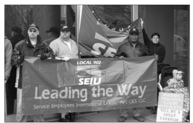
Facebook closed a Canadian casino workers' union website

That's the easy part. The hard part is we need to convince our audiences to use those tools, and not rely on Facebook as a way of staying in touch with us.