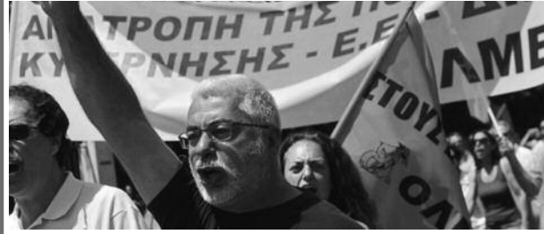
reek teachers protest

Our goal should be the formation of a left-wing government. That would boost the self-confidence of the Greek working-class and be a step forward in the fight for socialism.